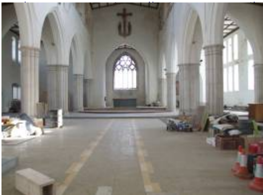
Open to everyone