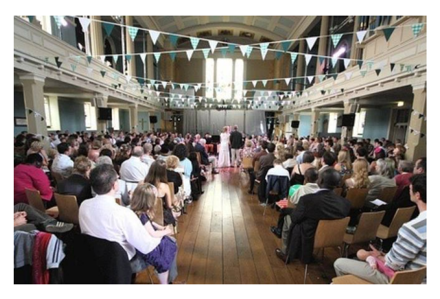
We had our reception in church too

A summer fete-style wedding, which took place in the church from start to finish, made sure everyone could be included.