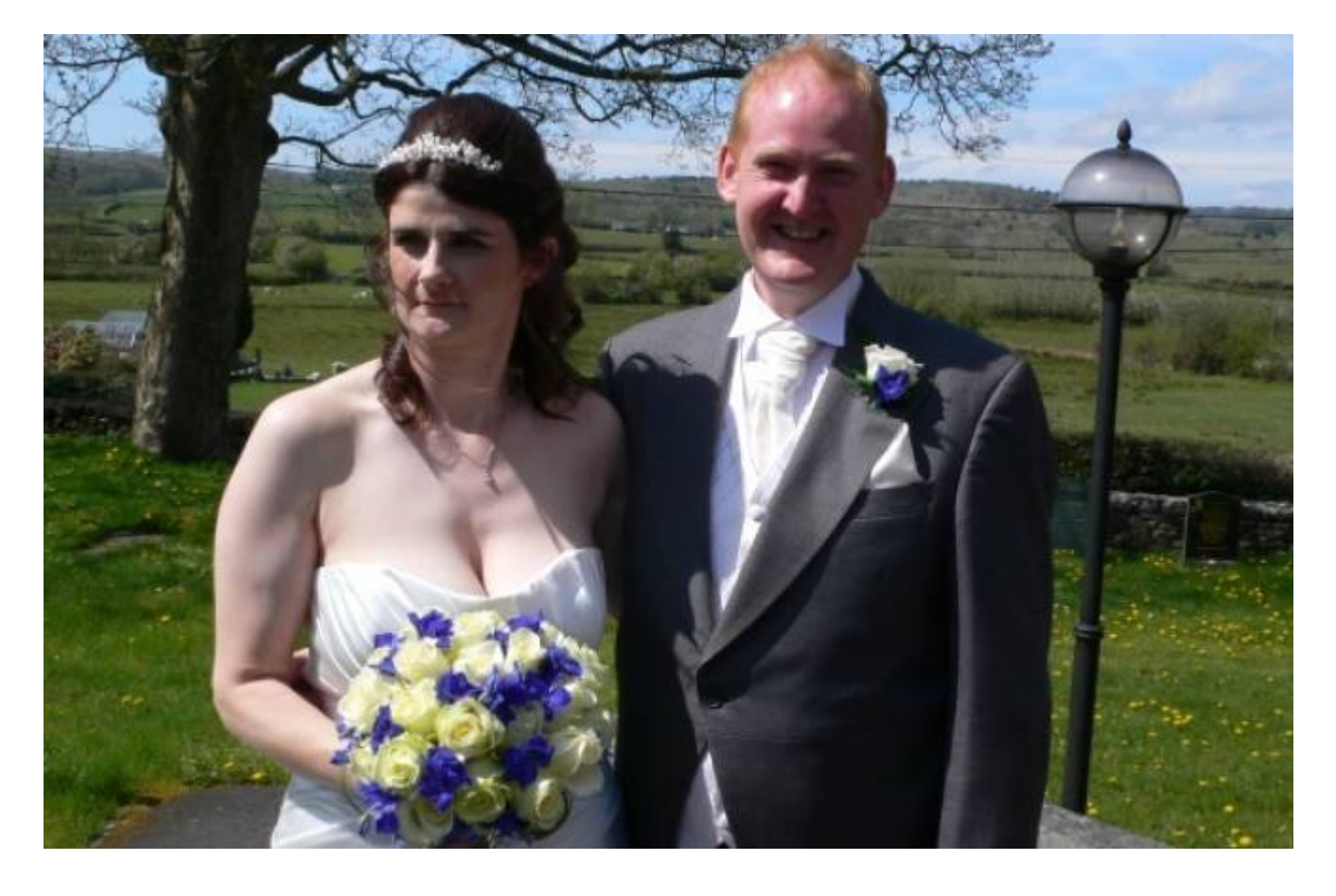
We wanted to say 'thank you' to our wonderful vicar

A summer fete-style wedding, which took place in the church from start to finish, made sure everyone could be included.