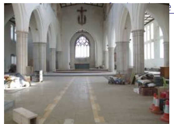
a gift in your will