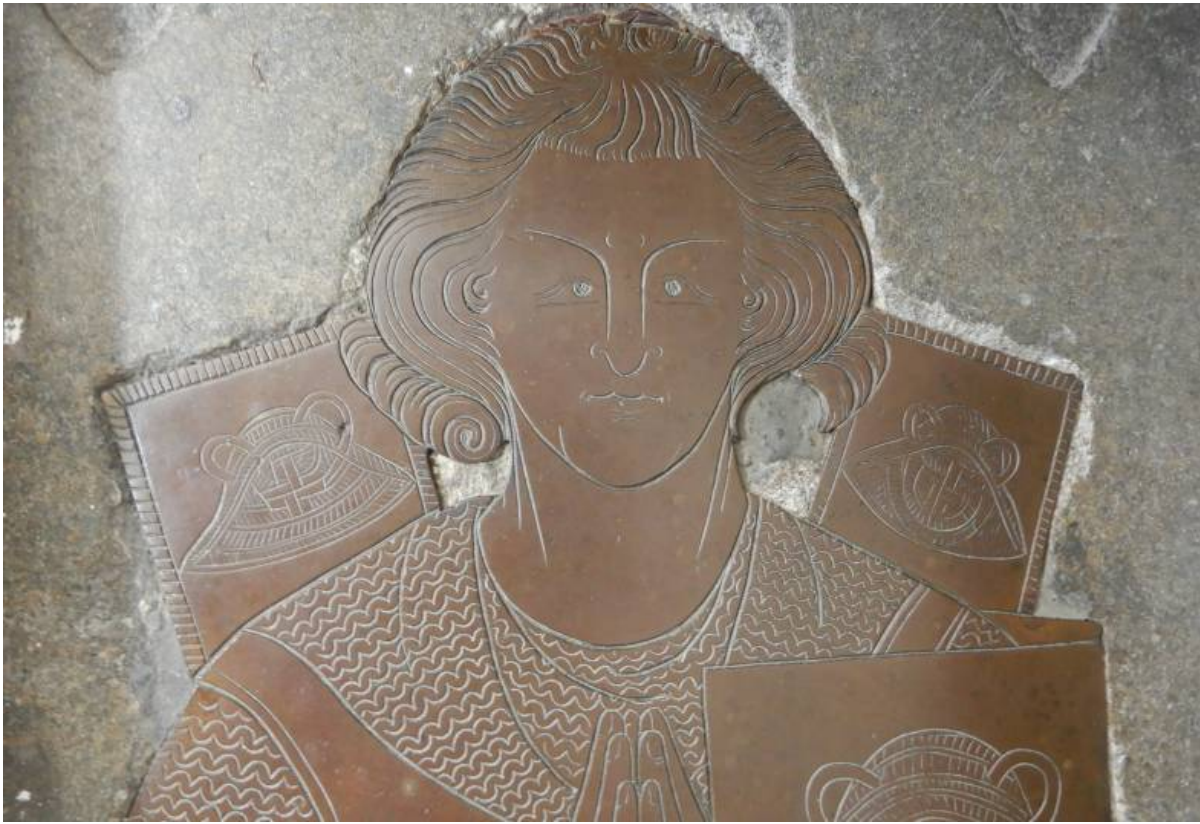
Rupert Harris Conservation Ltd