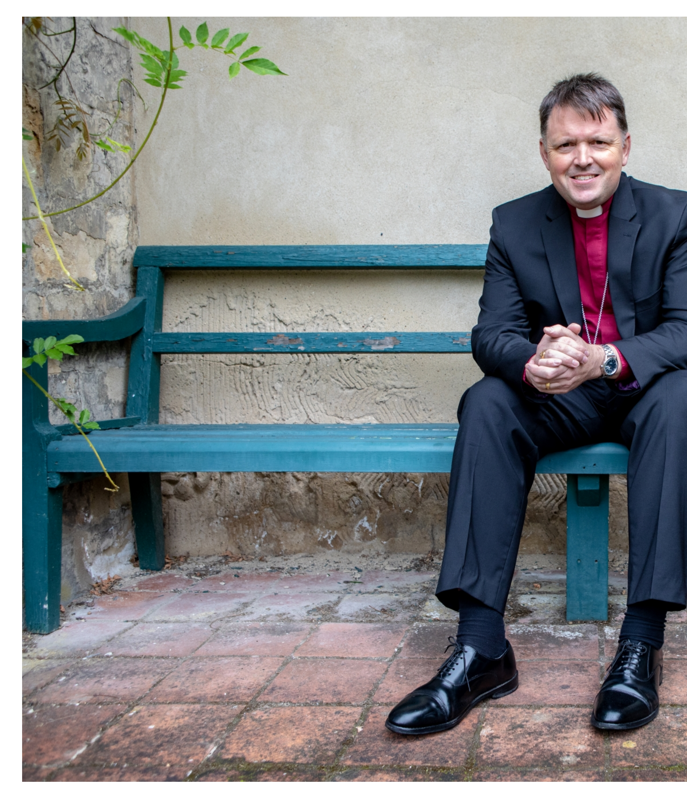
Sign up for our Newsletter

Sign up to our newsletter for monthly updates, webinar listings and latest resources to help you take action on environmental issues.