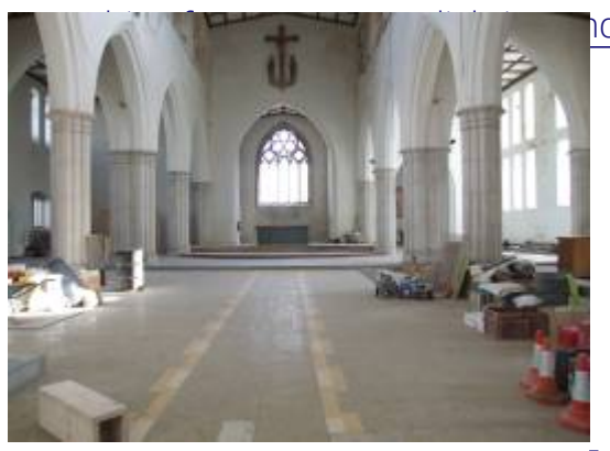
nd sound equipment