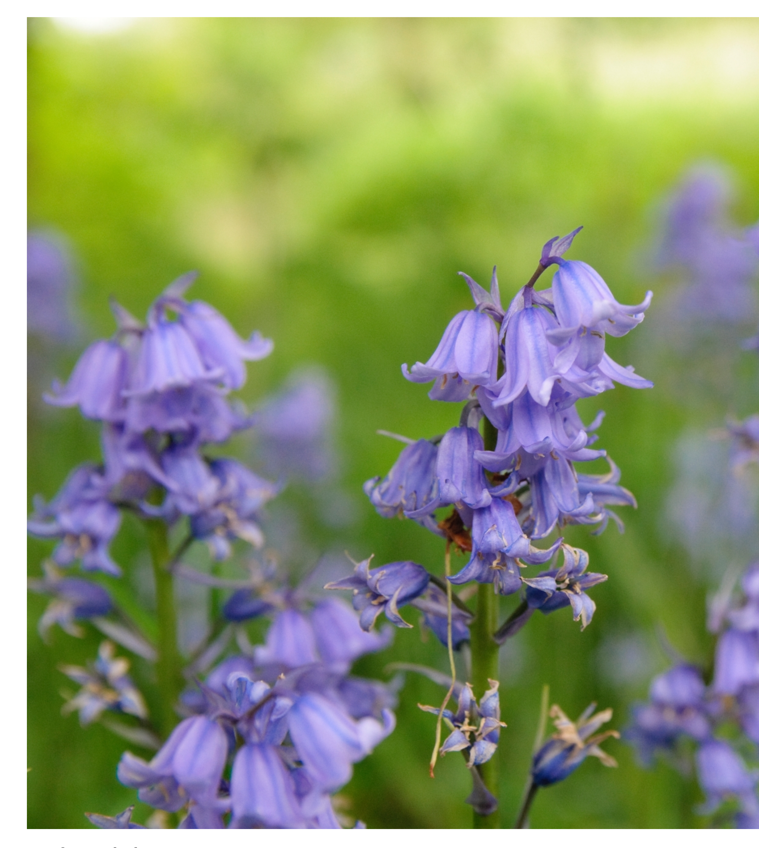
My funeral plans