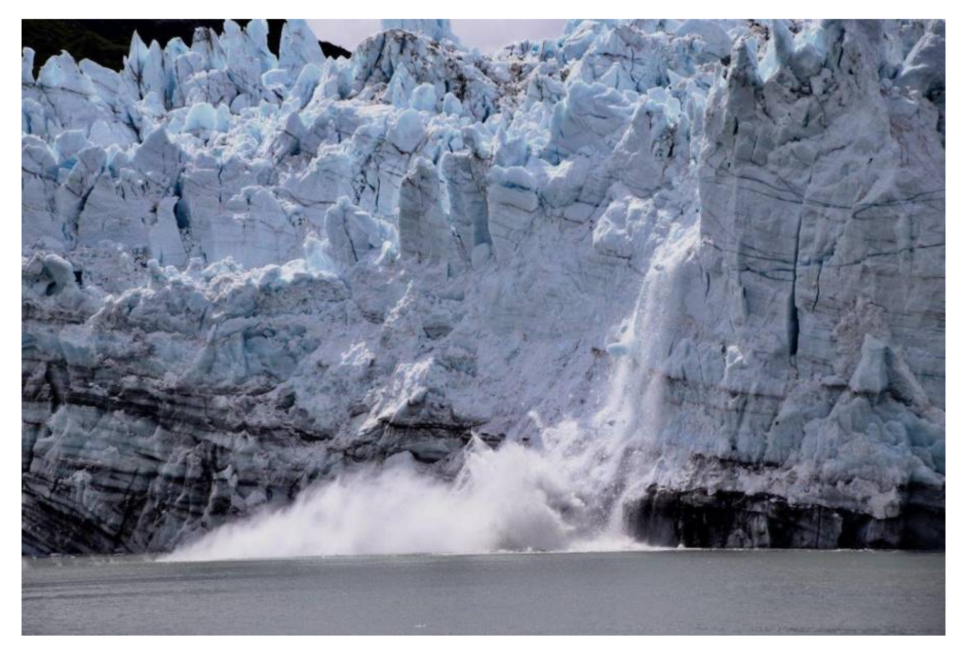
General Synod sets 2030 Net Zero carbon target

The Church of England's General Synod has set new targets for all parts of the church to work to become carbon 'net zero' by 2030.