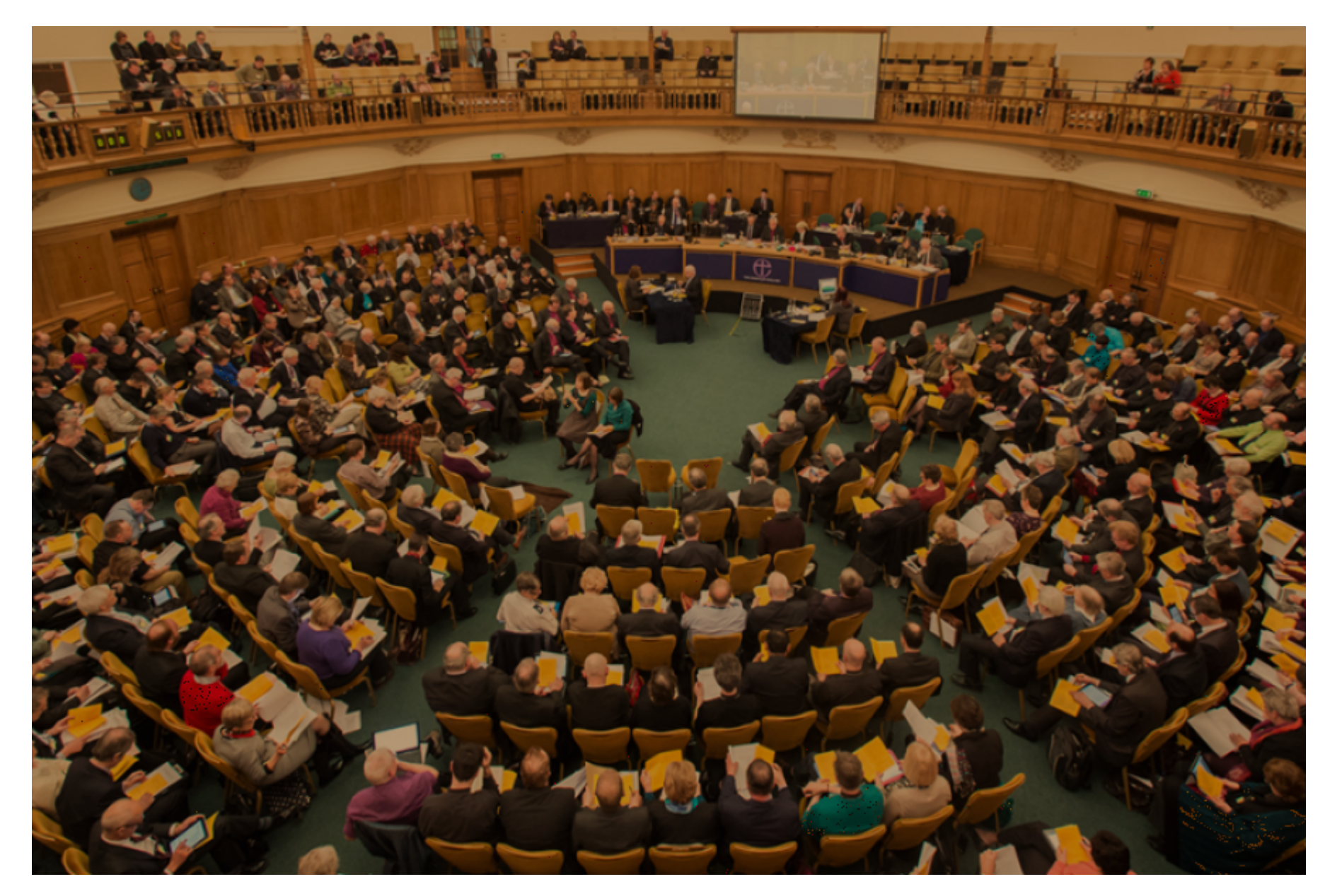
Legal aid an 'essential service' that should be preserved for the 'benefit of the nation', Synod votes

Changes to the legal aid system have left some of the most vulnerable groups in society without access to the justice system, the General Synod heard today.