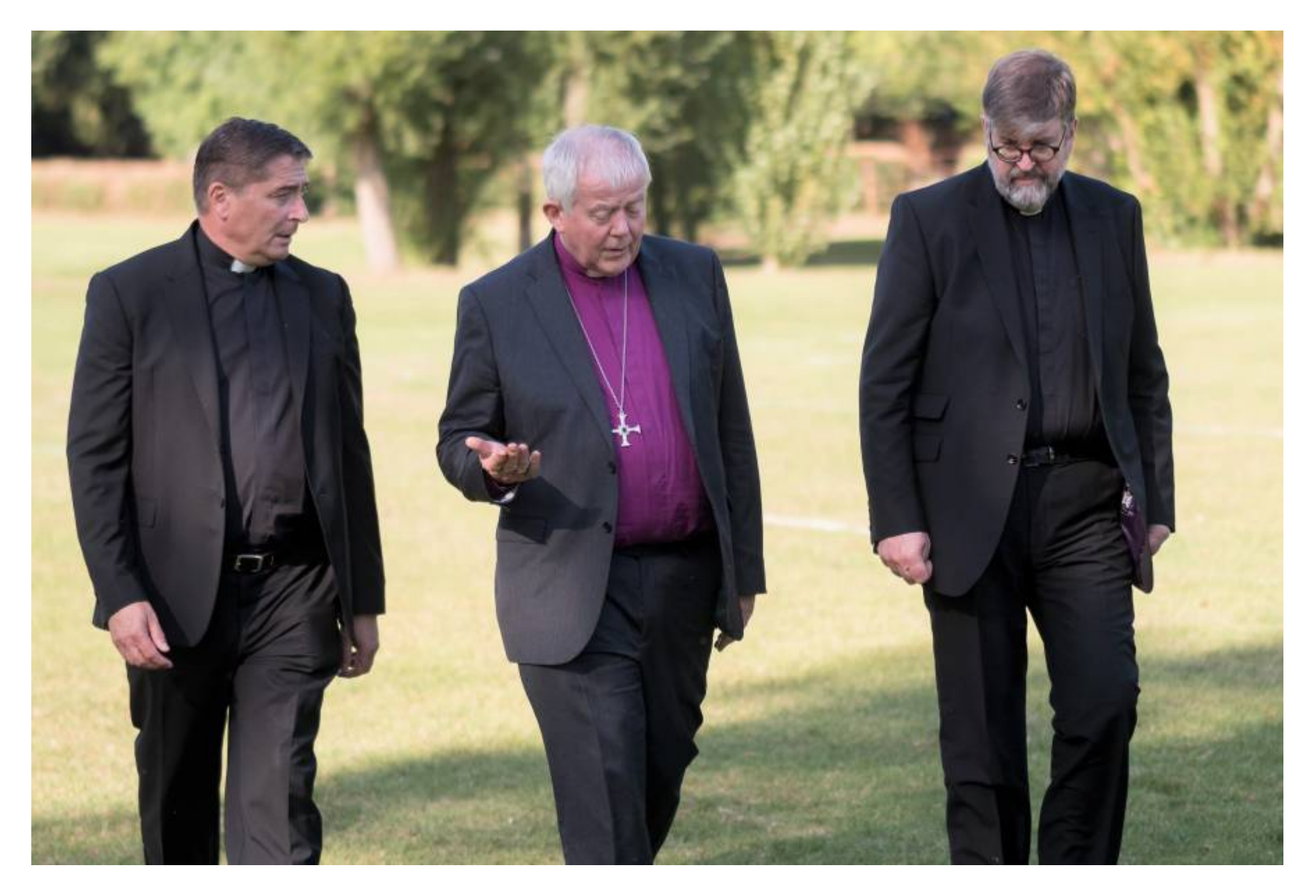
General Synod approves Channel Islands legislation

The General Synod of The Church of England has approved legislation following the Archbishop's Commission on the relationship of the Channel Islands to the wider Church of England.