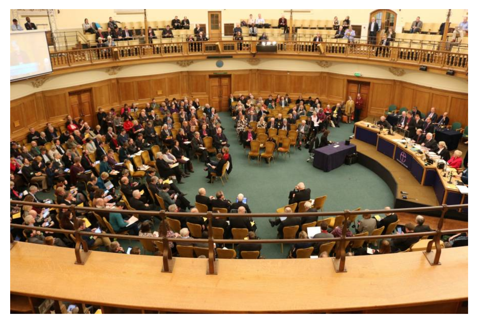
Covenant for Clergy Care and Wellbeing declared Act of Synod

Measures to promote awareness of the dangers of stress and burnout amongst clergy are to be debated by the 42 Church of England dioceses following a landmark vote today by the General Synod.