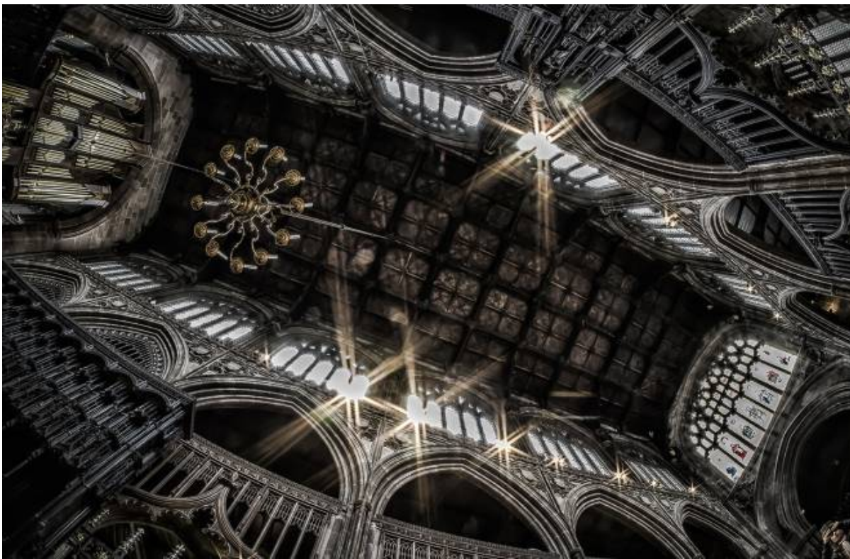
May Fong Li

Durham Cathedral, Canterbury Cathedral and Westminster Abbey are also World Heritage Sites