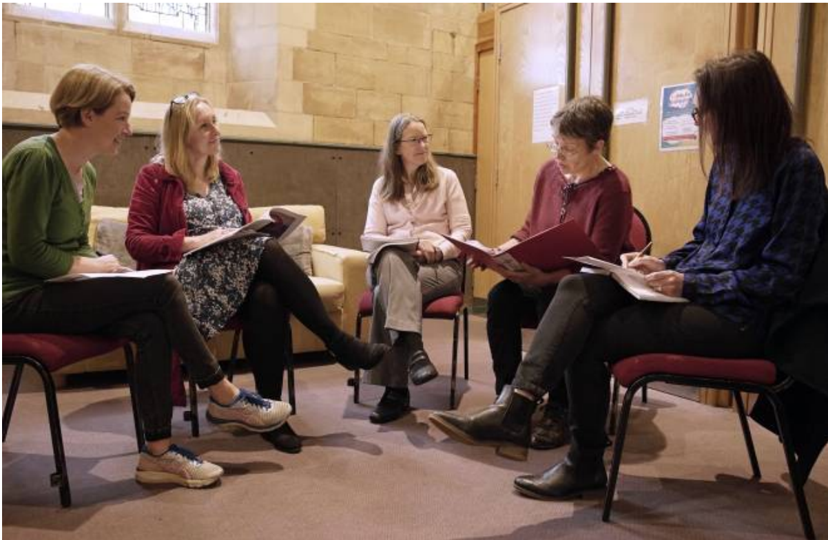
te of the church.

Disciple members, through resources, teaching and learning, so people can grow in an understanding of God's generosity towards them, and how they can live generous lives.