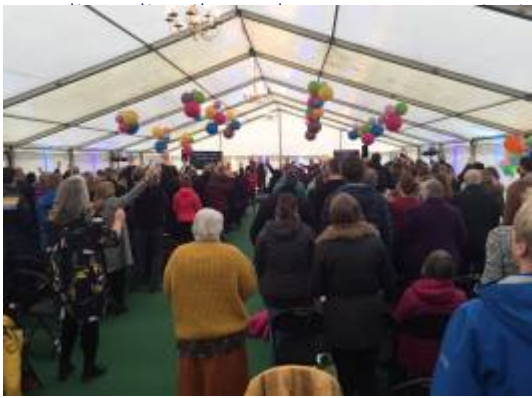
on in lower income areas