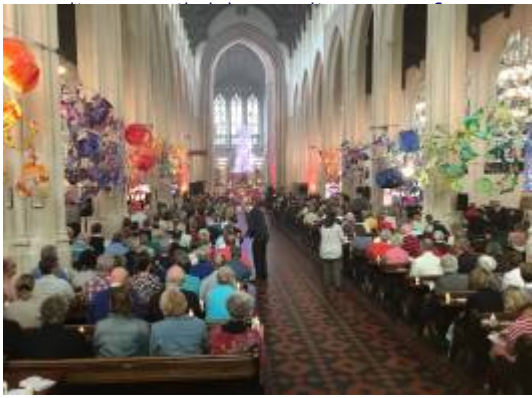
y growth opportunities