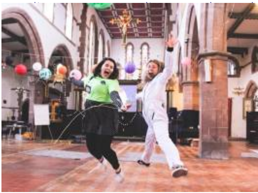
major change programmes.

Funding to support the testing and development of new ideas.