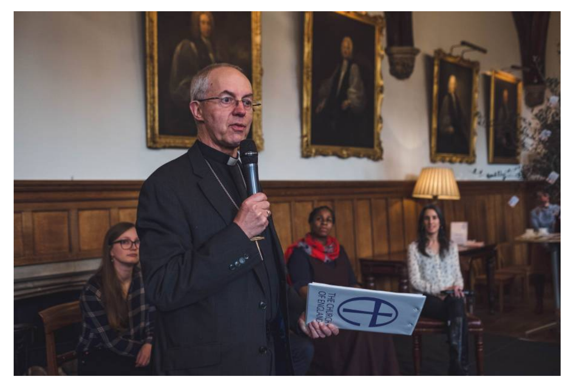
Archbishop launches Church of England's first ever Green Lent campaign