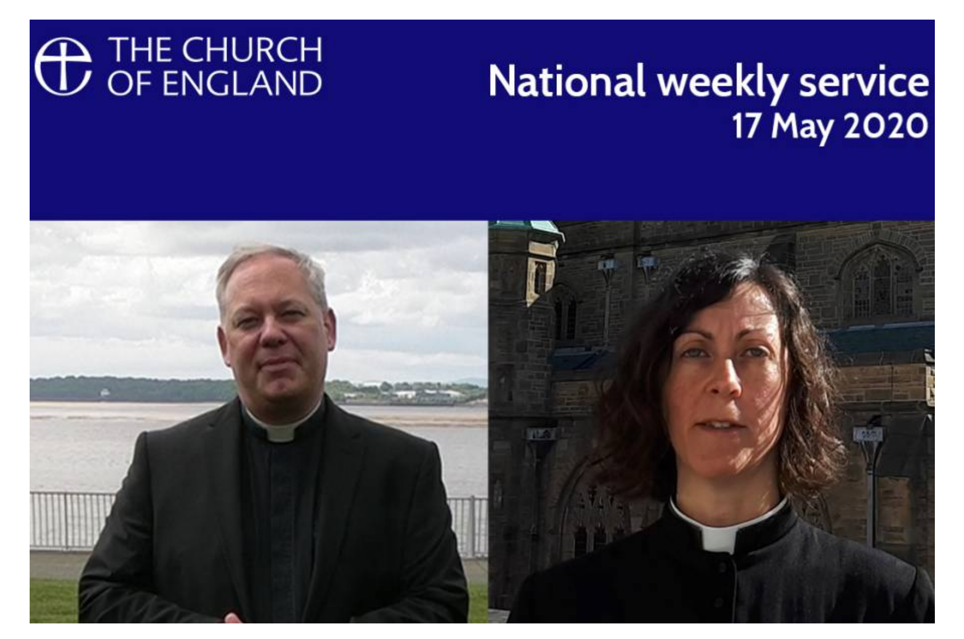
Actor, GP and palliative care nurse to take part in this week's national online service