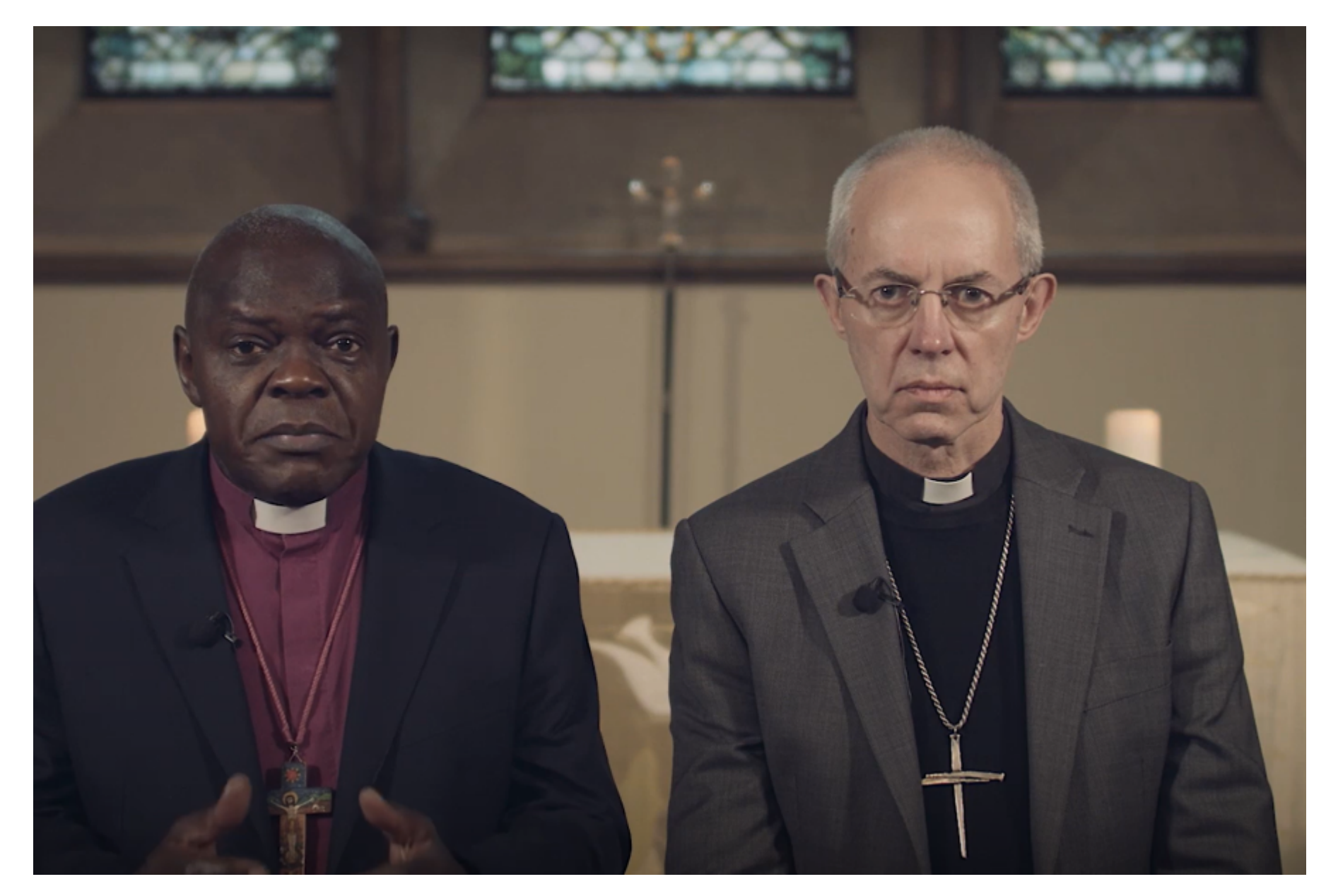
A statement from the Archbishops of Canterbury and York in response to events in the United States of