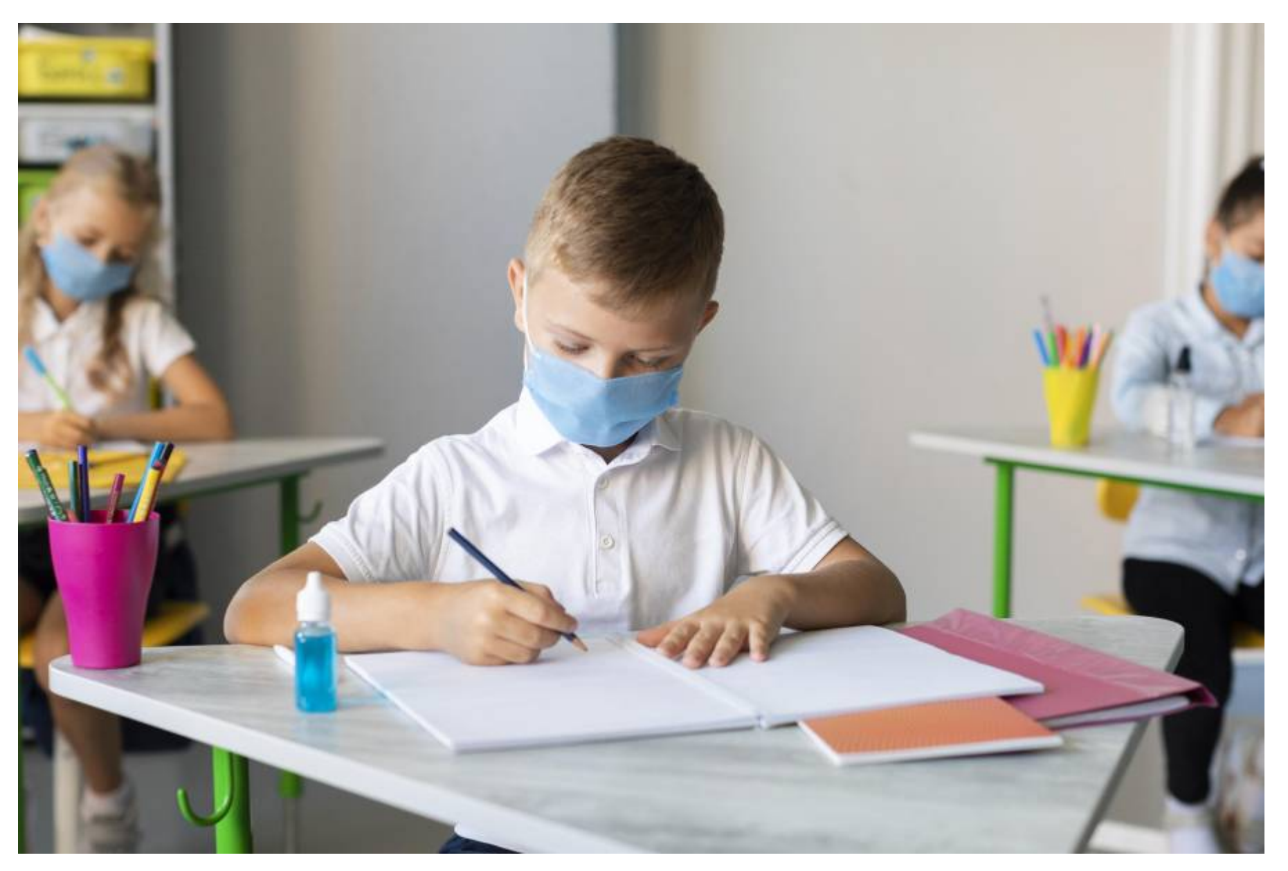
Archbishop of Canterbury and Bishop of Durham urge Government to expand free school meals to avoid