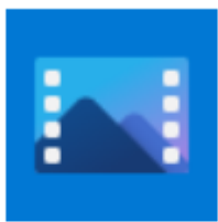
Video editor App

Found in your windows photo app, Video editor allows you to upload multiple videos to piece together, edit clips and include static images and text before downloading as a new video. It's easy to get started.