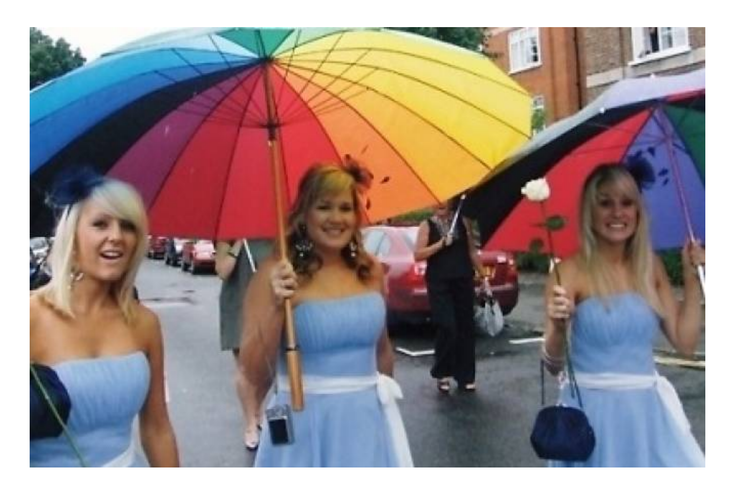
Our wedding was a gift from our guests