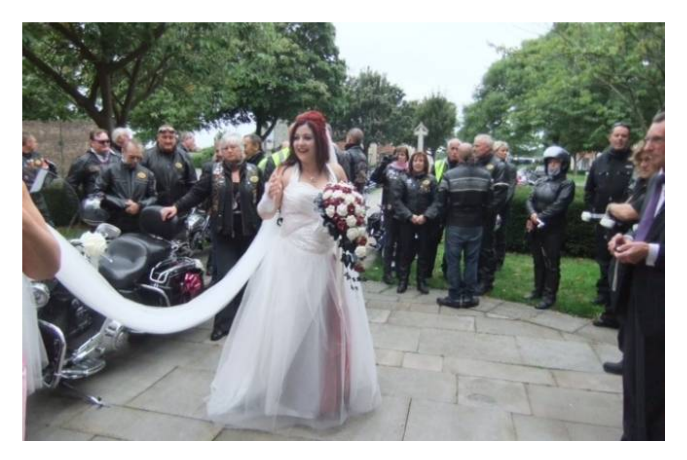
More revs than one at our biker wedding!