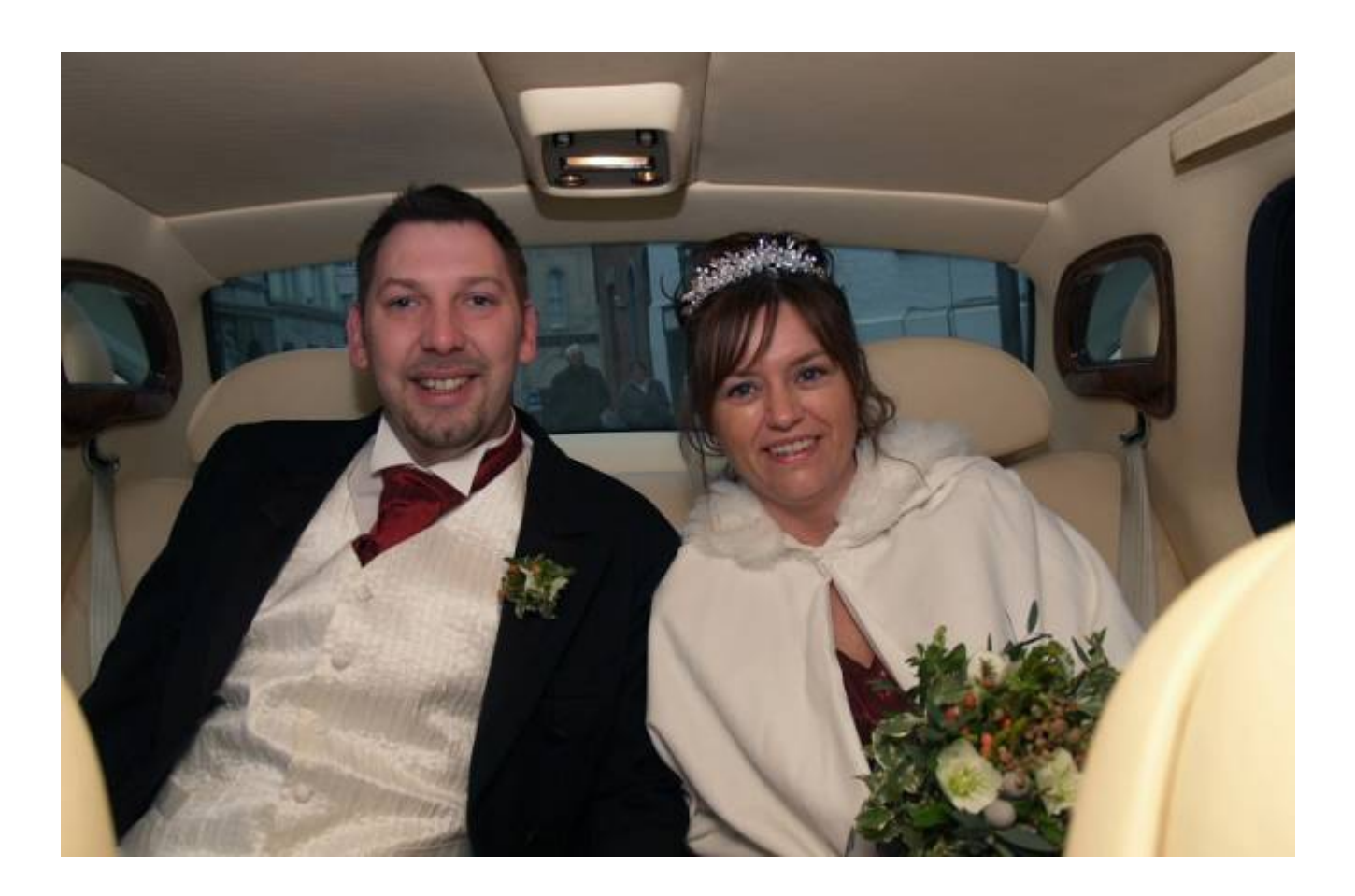
Church just felt the right place to be