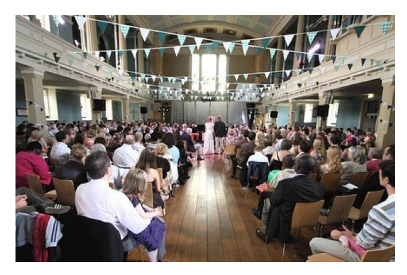
We had our reception in church too