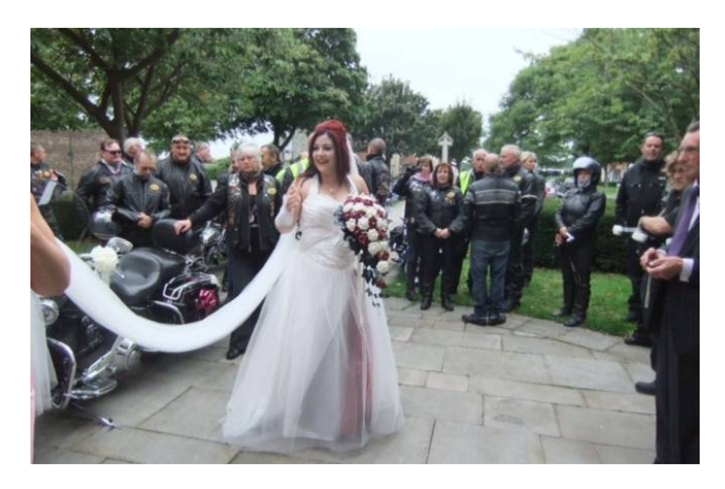
More revs than one at our biker wedding!