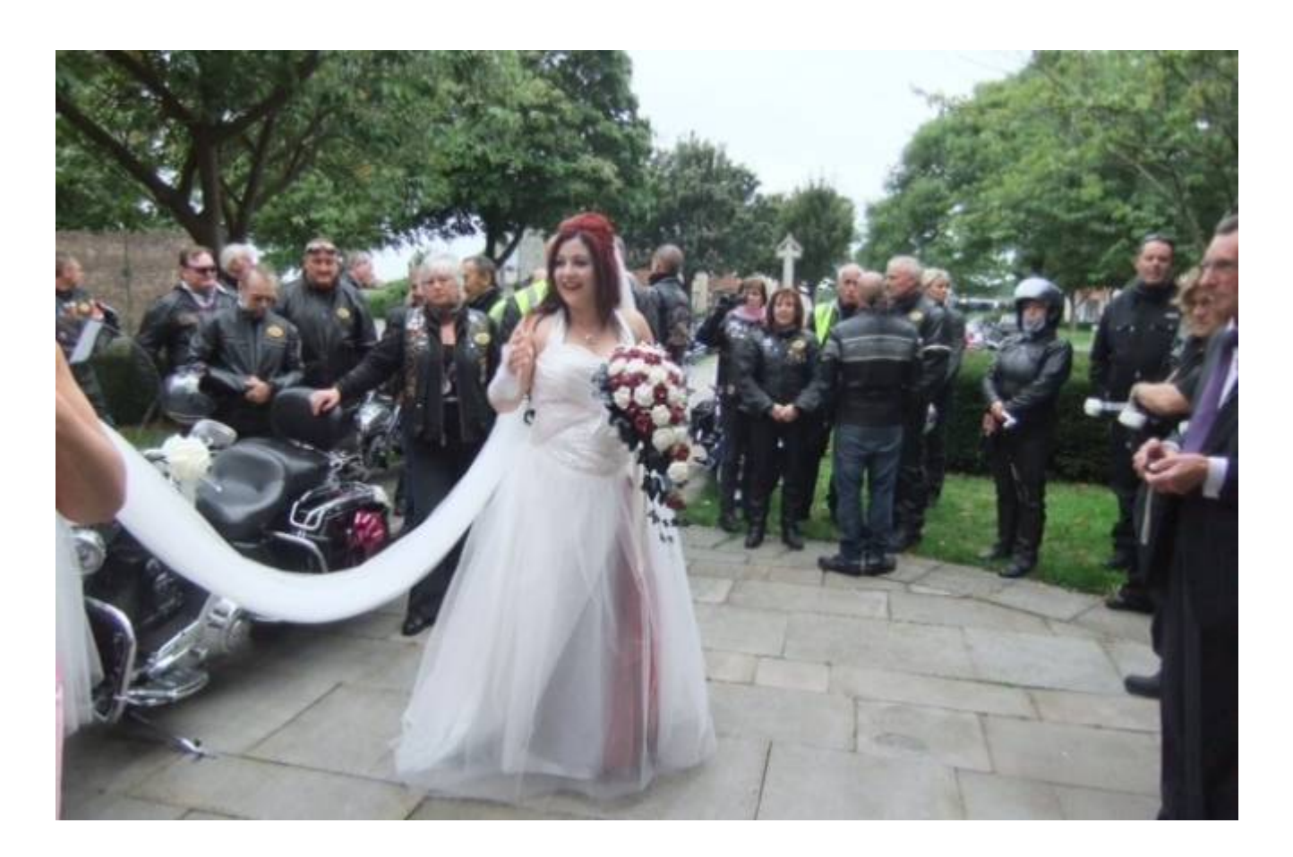
More revs than one at our biker wedding!