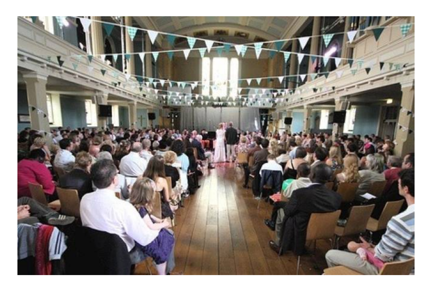
We had our reception in church too