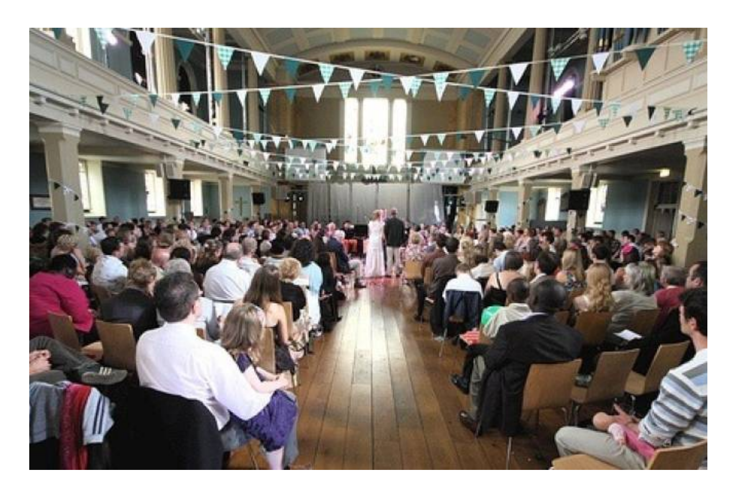
We had our reception in church too