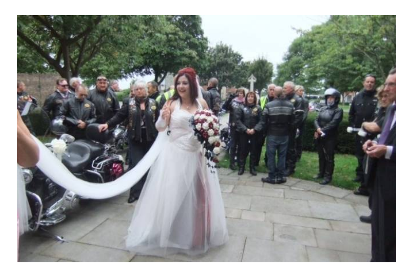
More revs than one at our biker wedding!