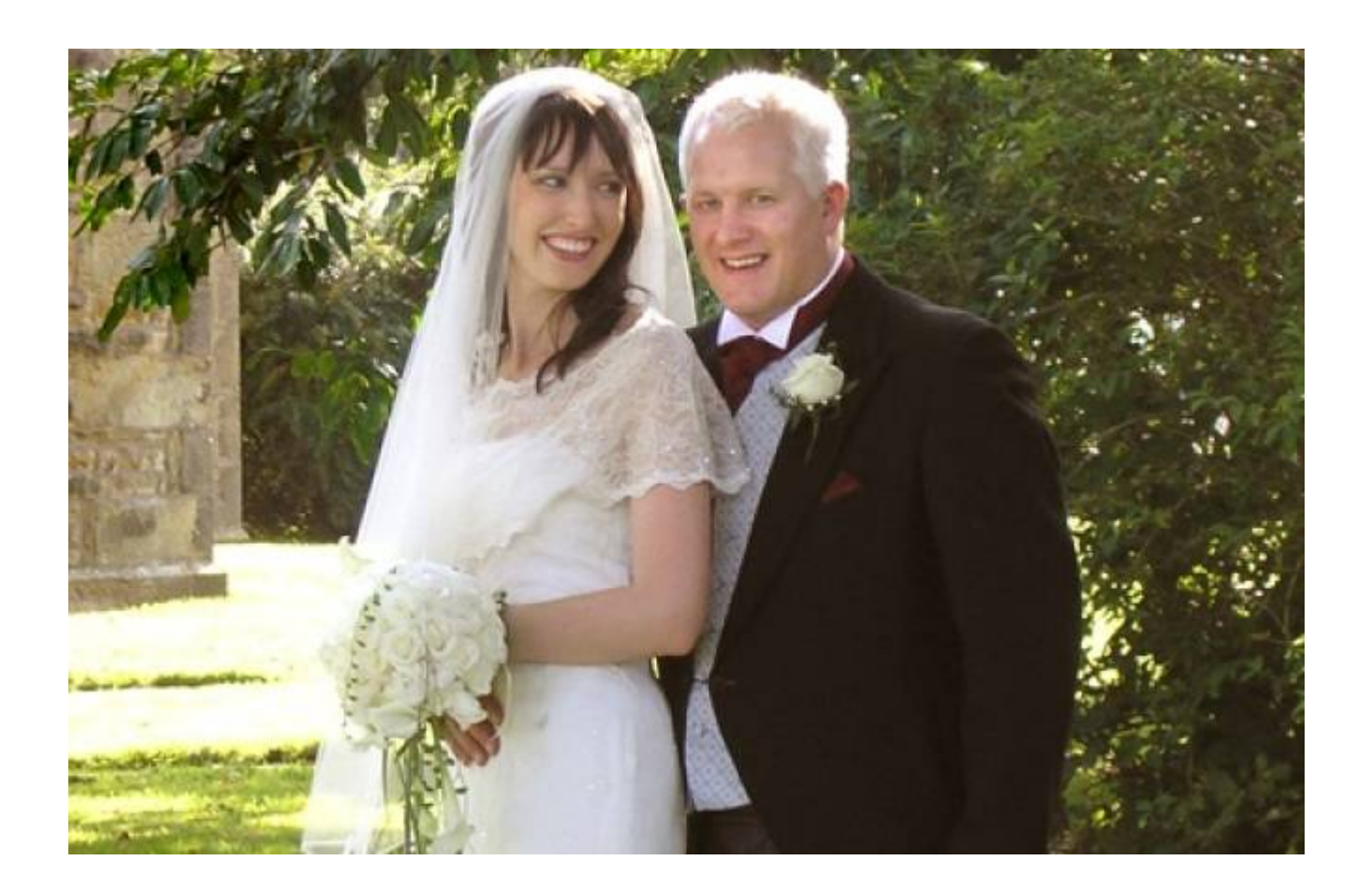
We discovered the church on our doorstep