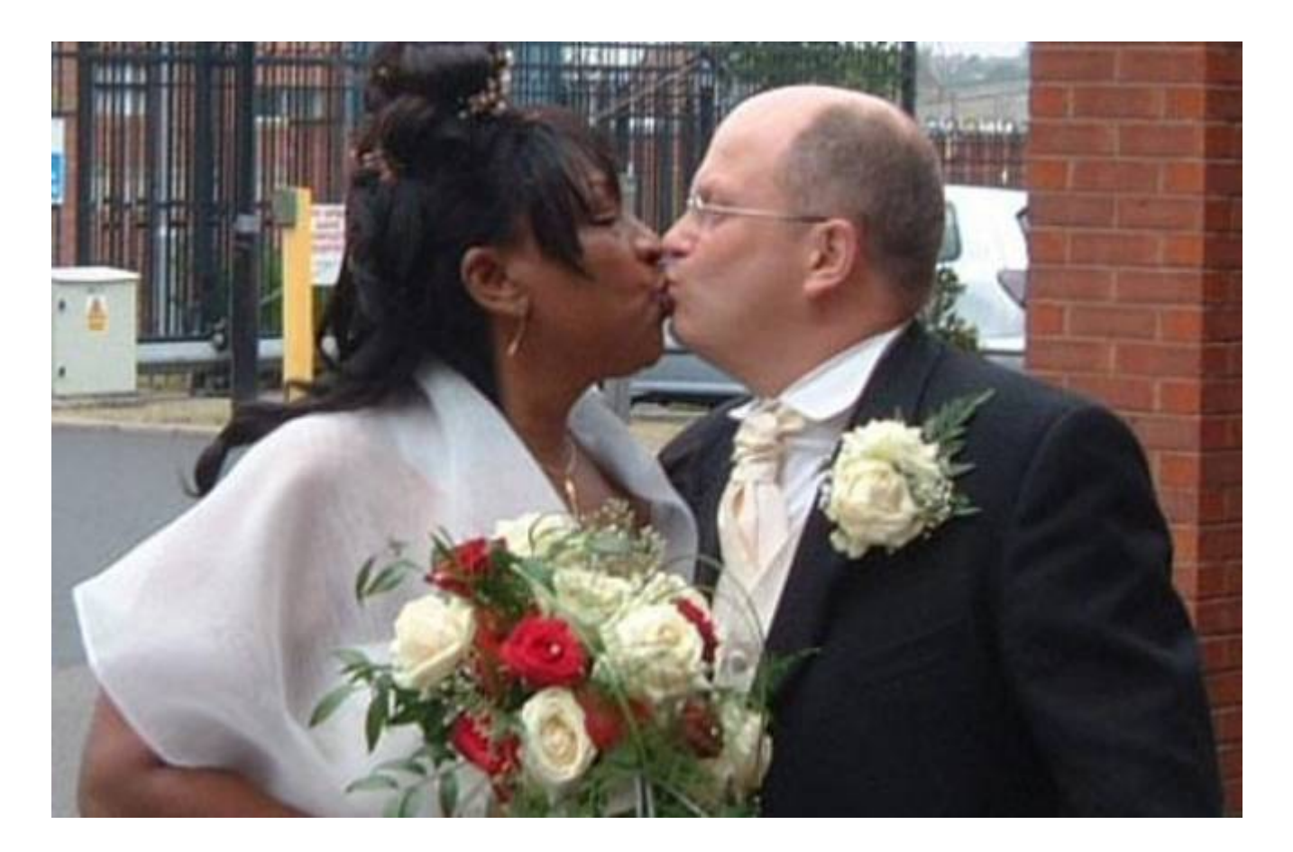
We fell in love with our 'football' church