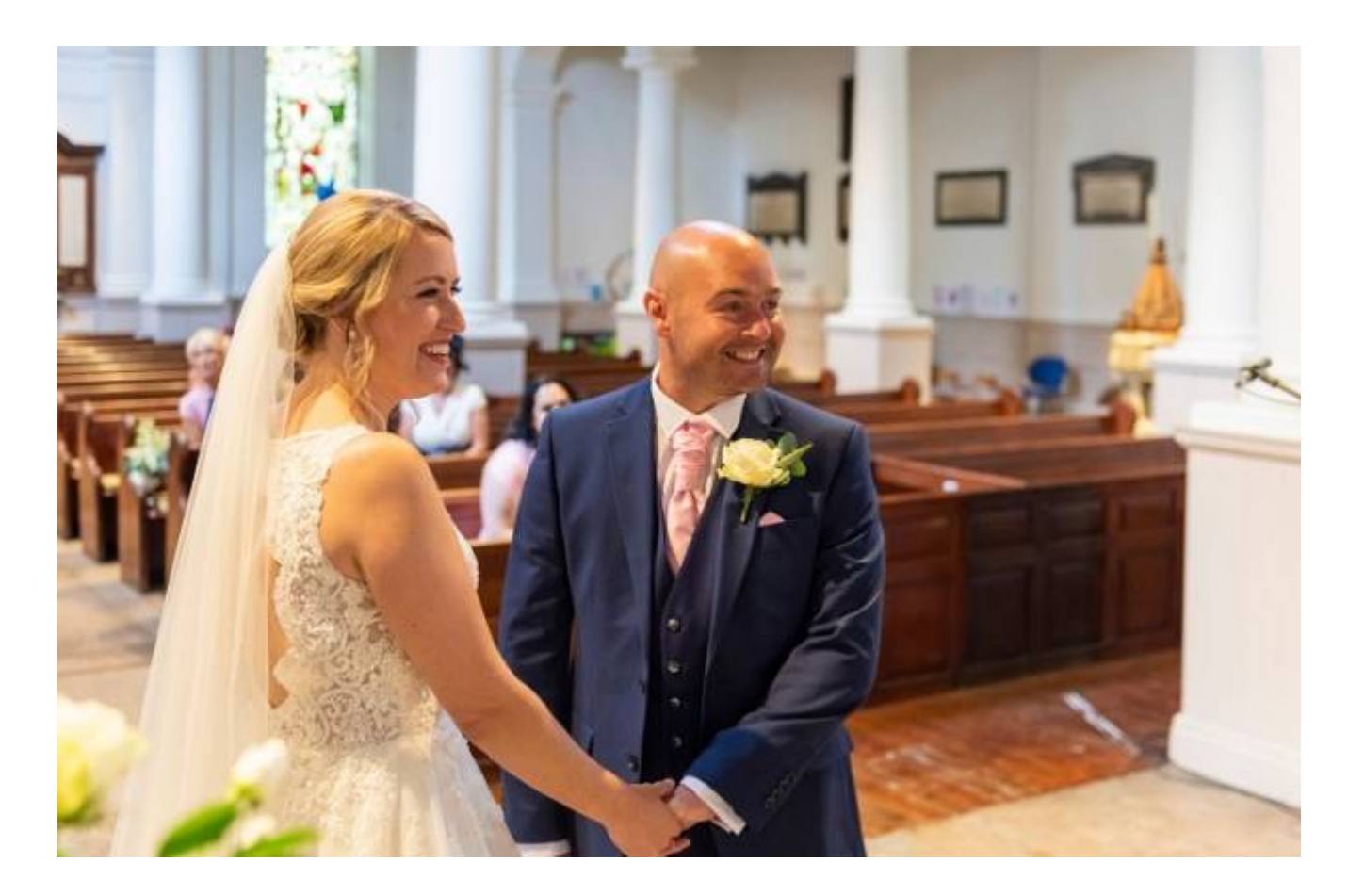
Our pandemic wedding was so special