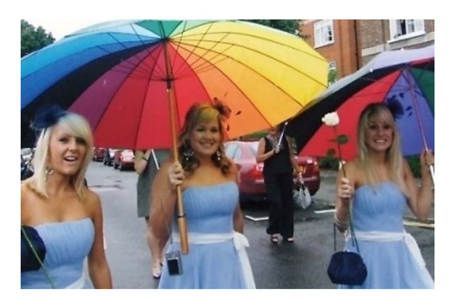
Our wedding was a gift from our guests