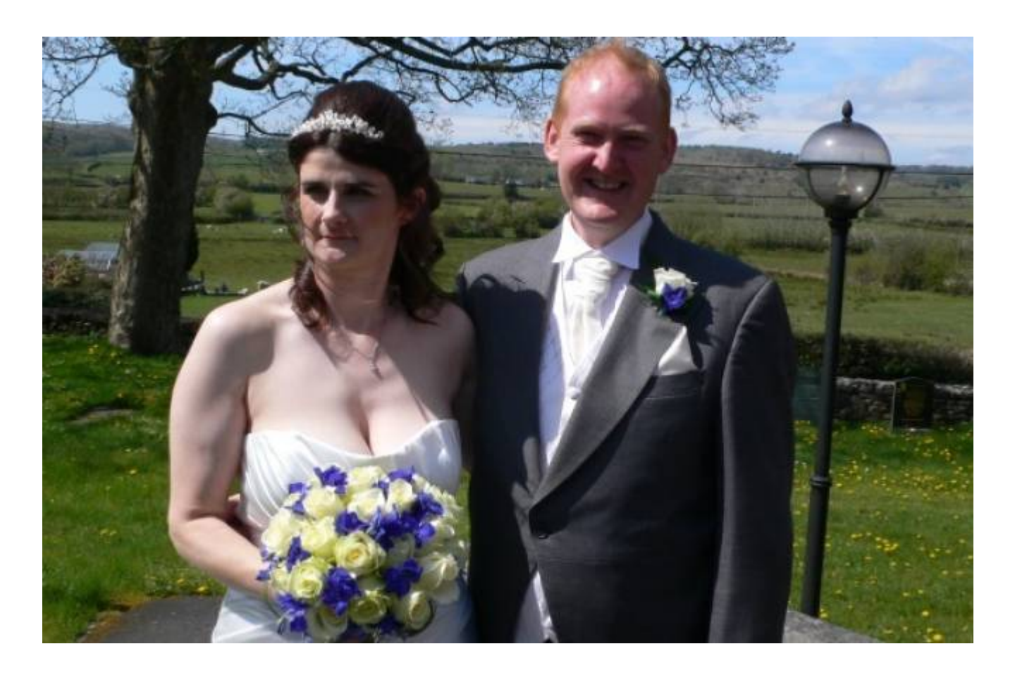
We wanted to say 'thank you' to our wonderful vicar