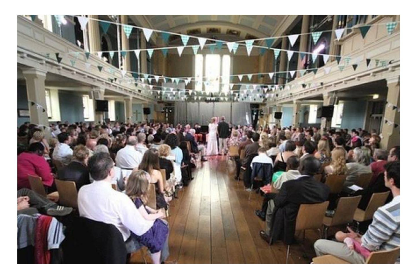
We had our reception in church too