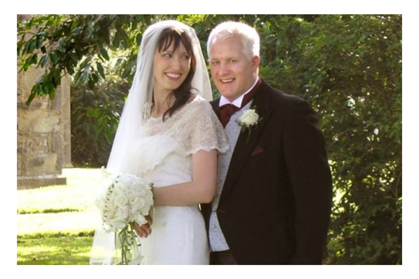
We discovered the church on our doorstep