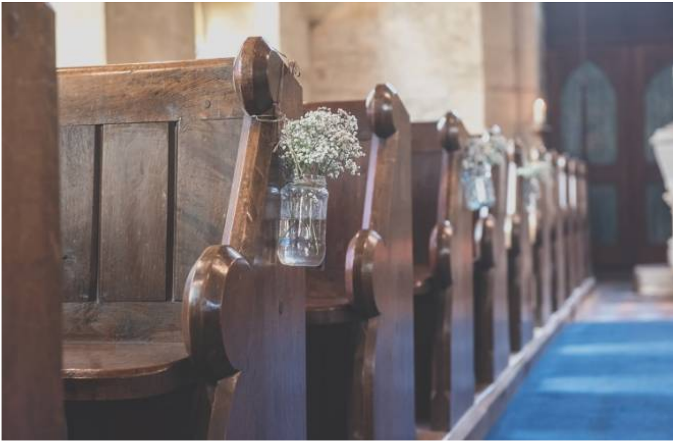
Booking a church