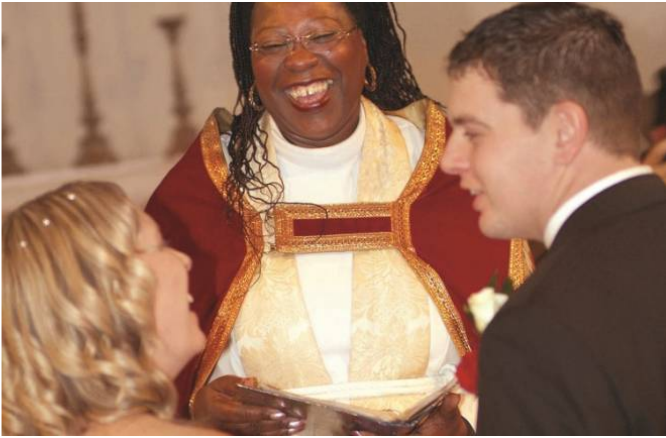
Meeting the vicar