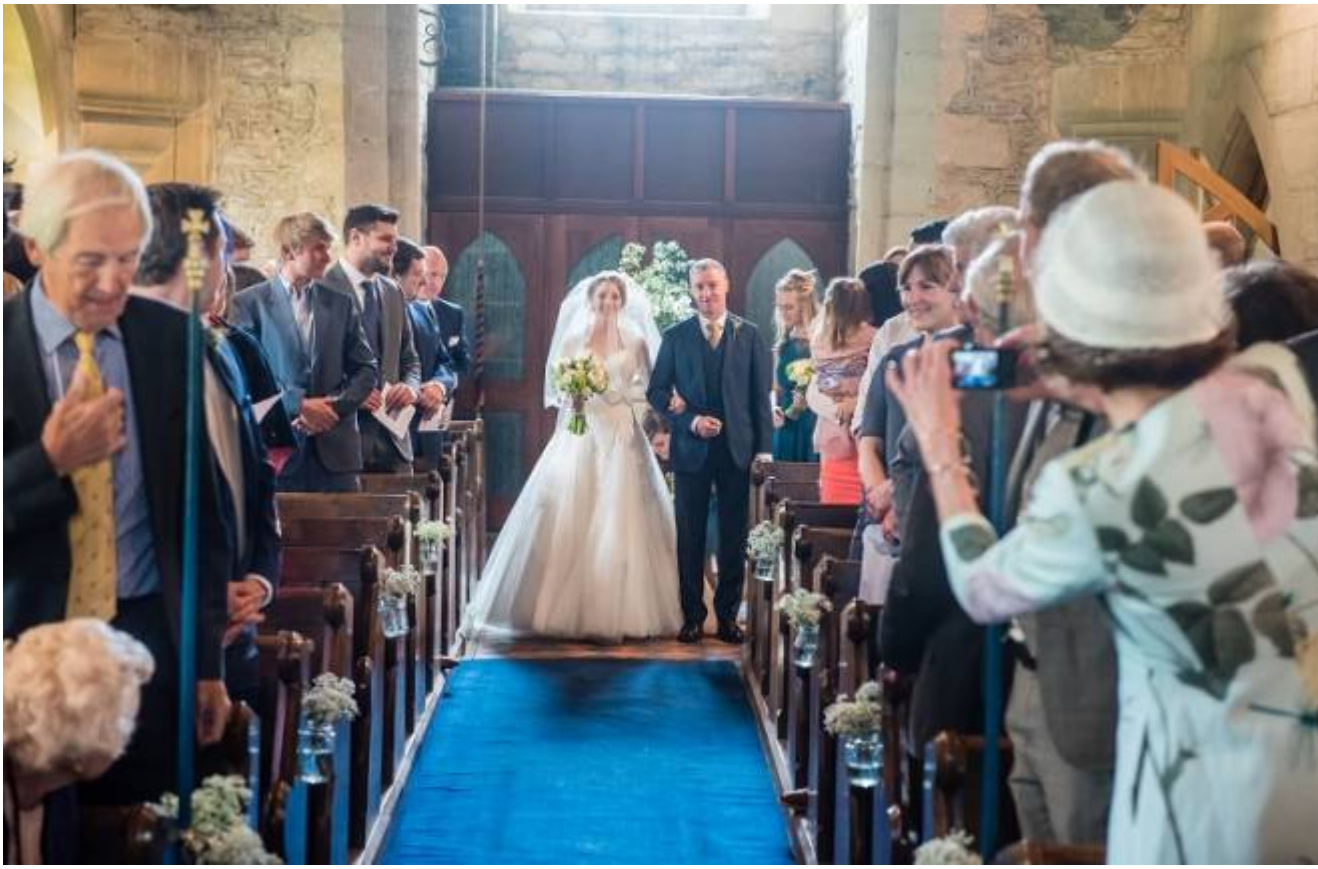
Walking down the aisle