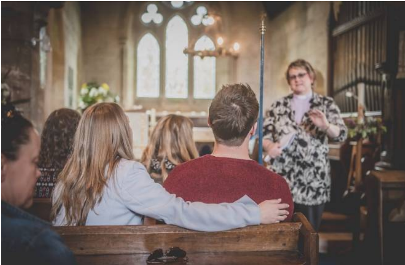
Reading of banns