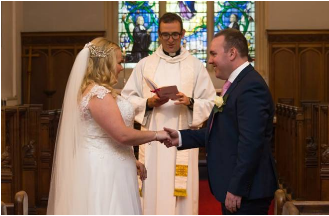
Wedding ceremony words