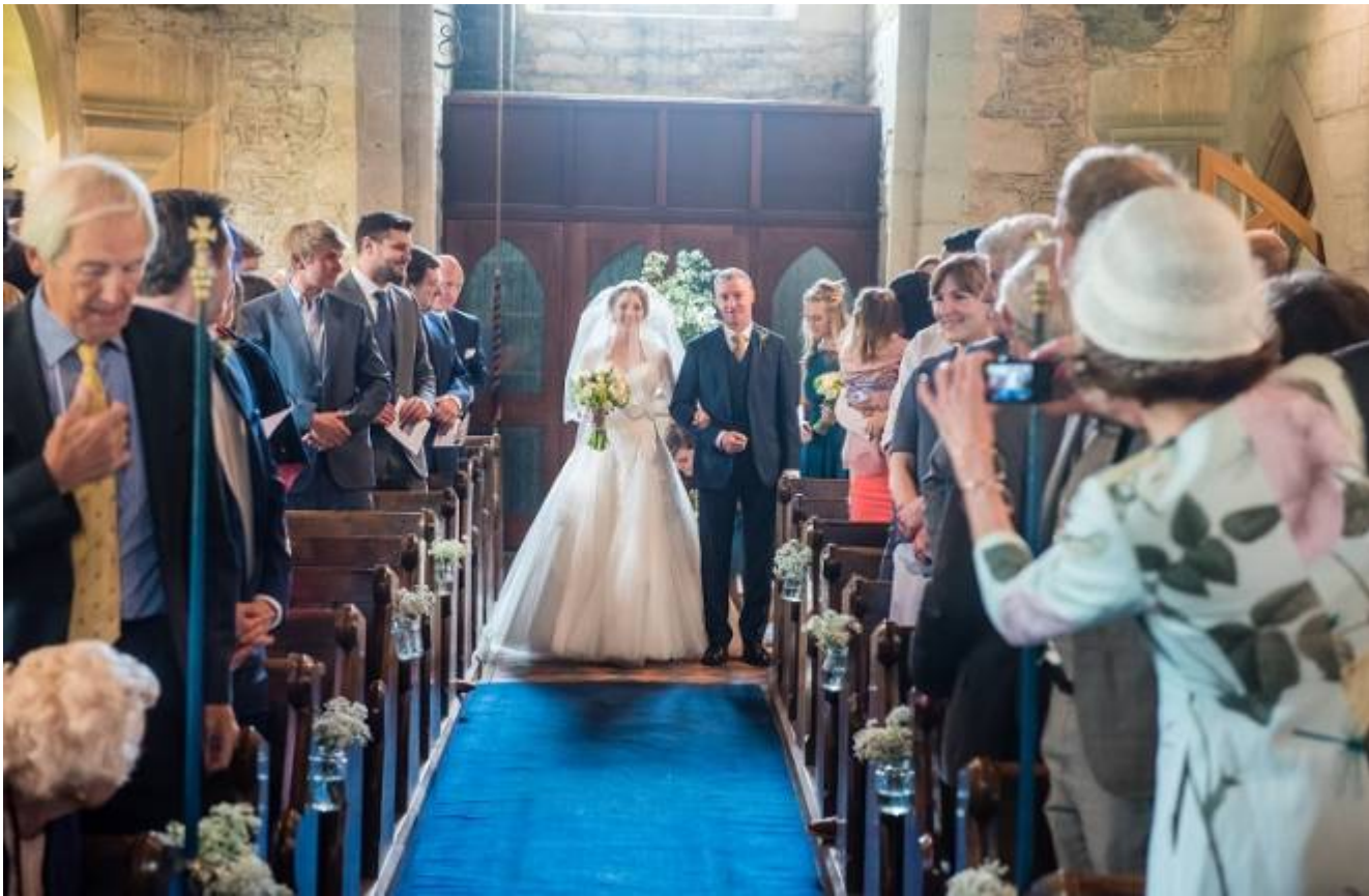
Walking down the aisle