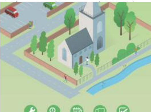
Celebrate the environment