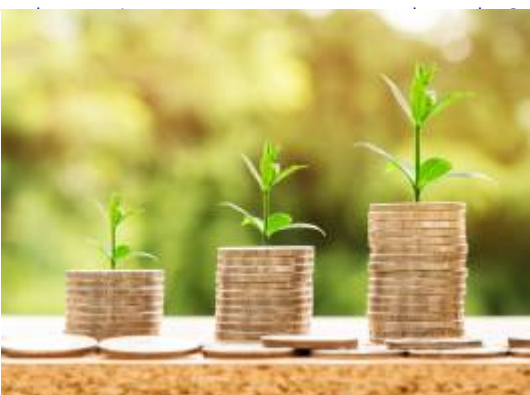
Protect your community from climate risks

Use our resources to help raise money for your environmental projects