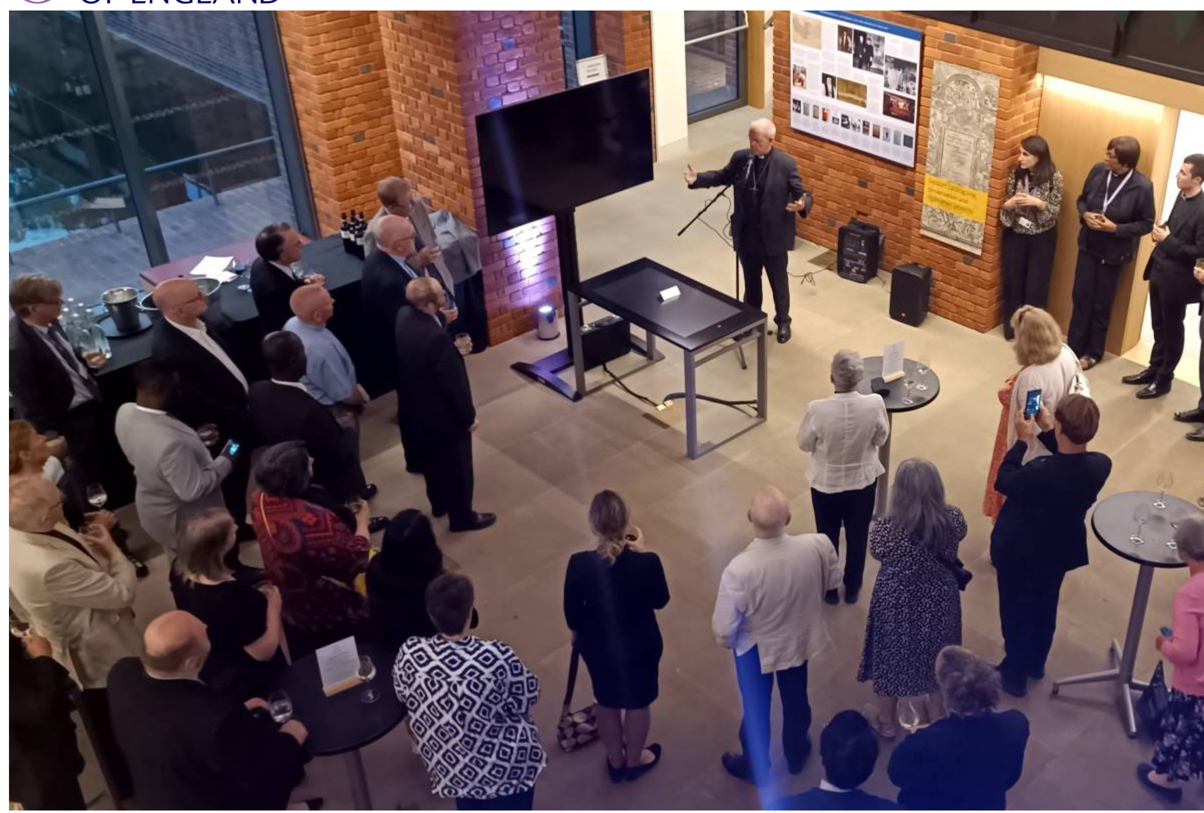
Working together for unity