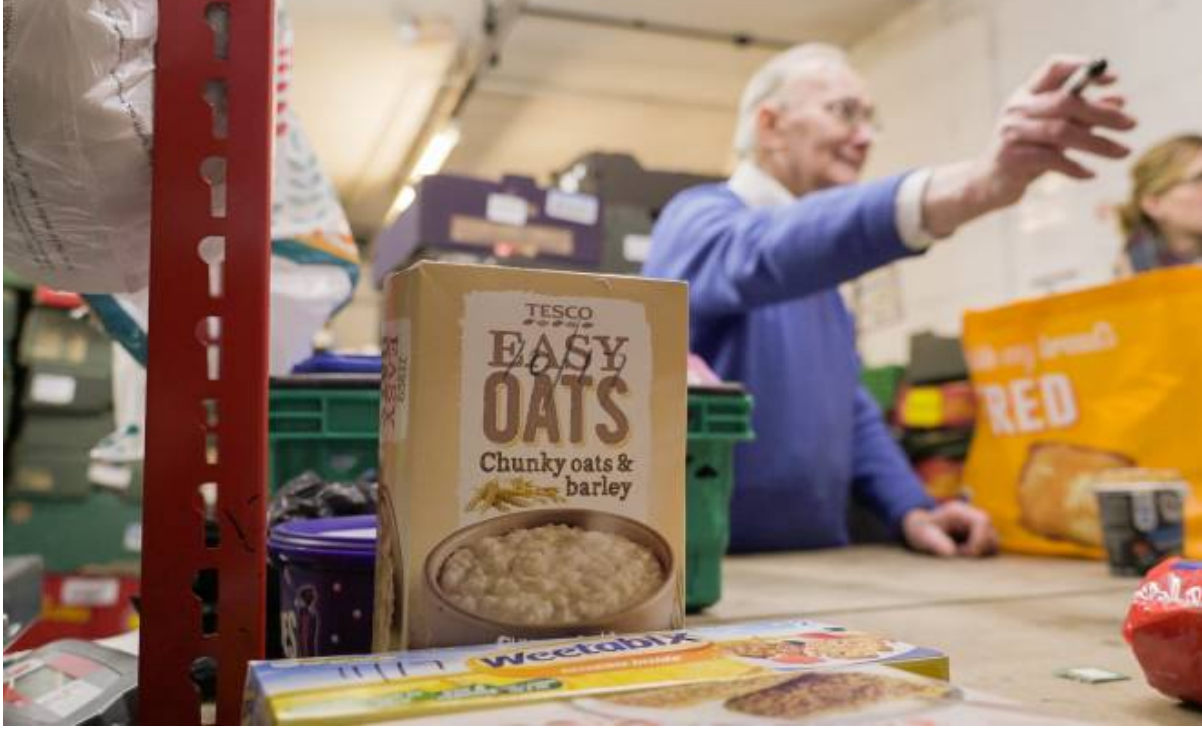
Diocese of Birmingham