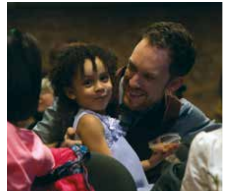
Celebrating the launch of St Luke's, Gas Street in Birmingham (p3)

Investing ethically with responsible governance