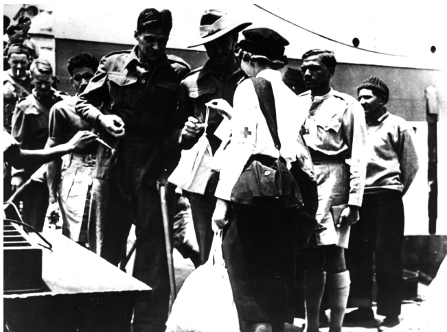
A Red Cross officer meeting POWs and giving them 'comfort' bags.