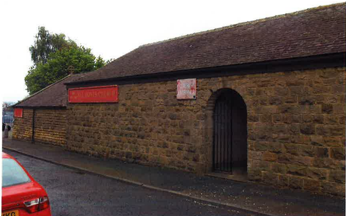
Entrance on Cross Aysgarth Mount