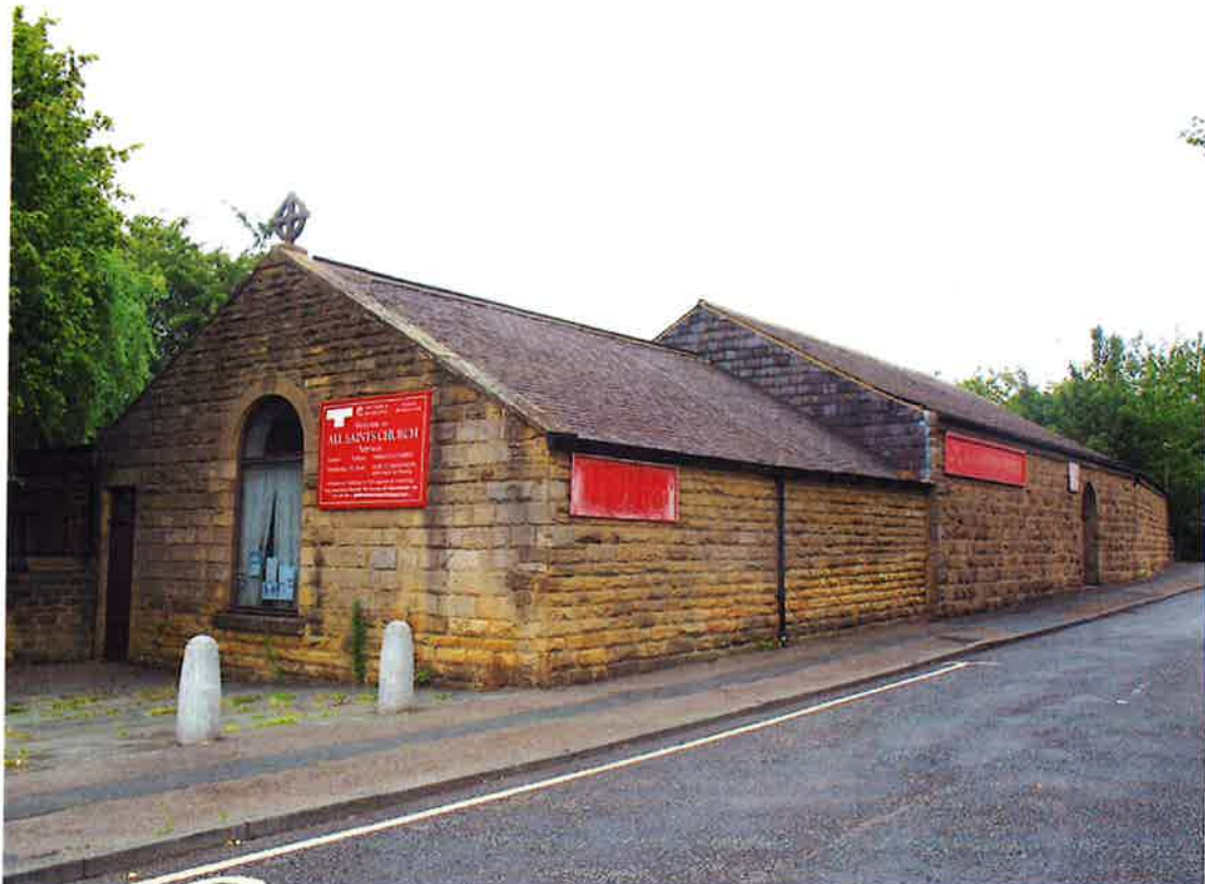
View from Pontefract Lane from the west