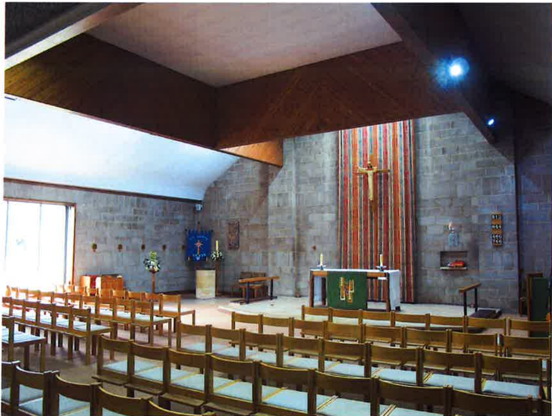
Worship area looking to liturgical east