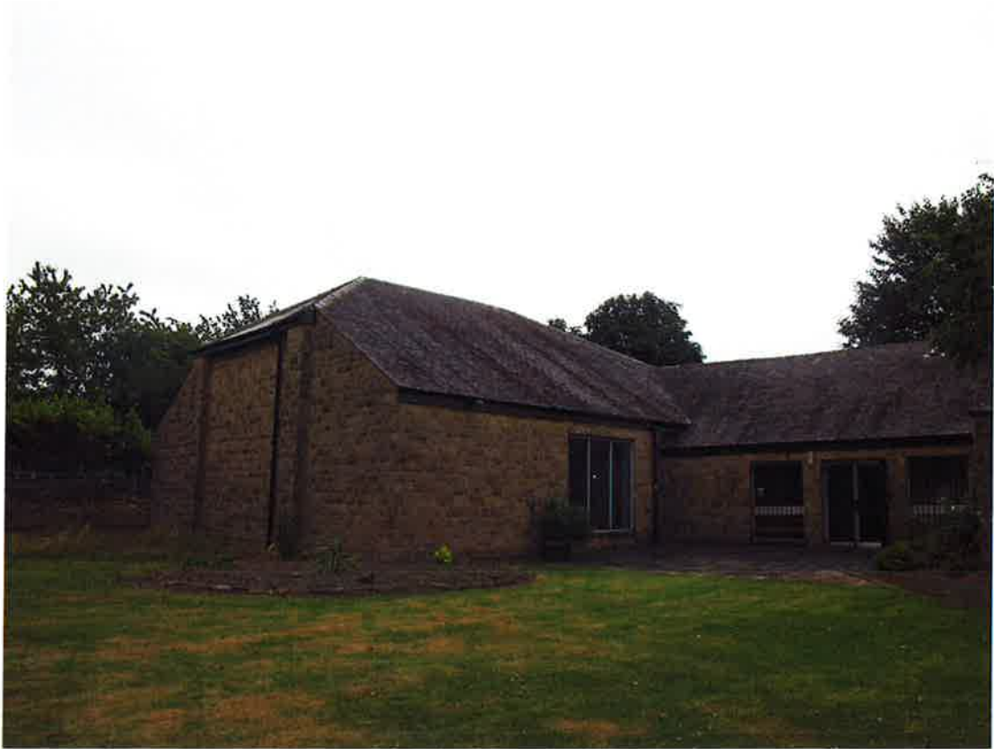
View from the garden – church to the left, lobby/hall to the right