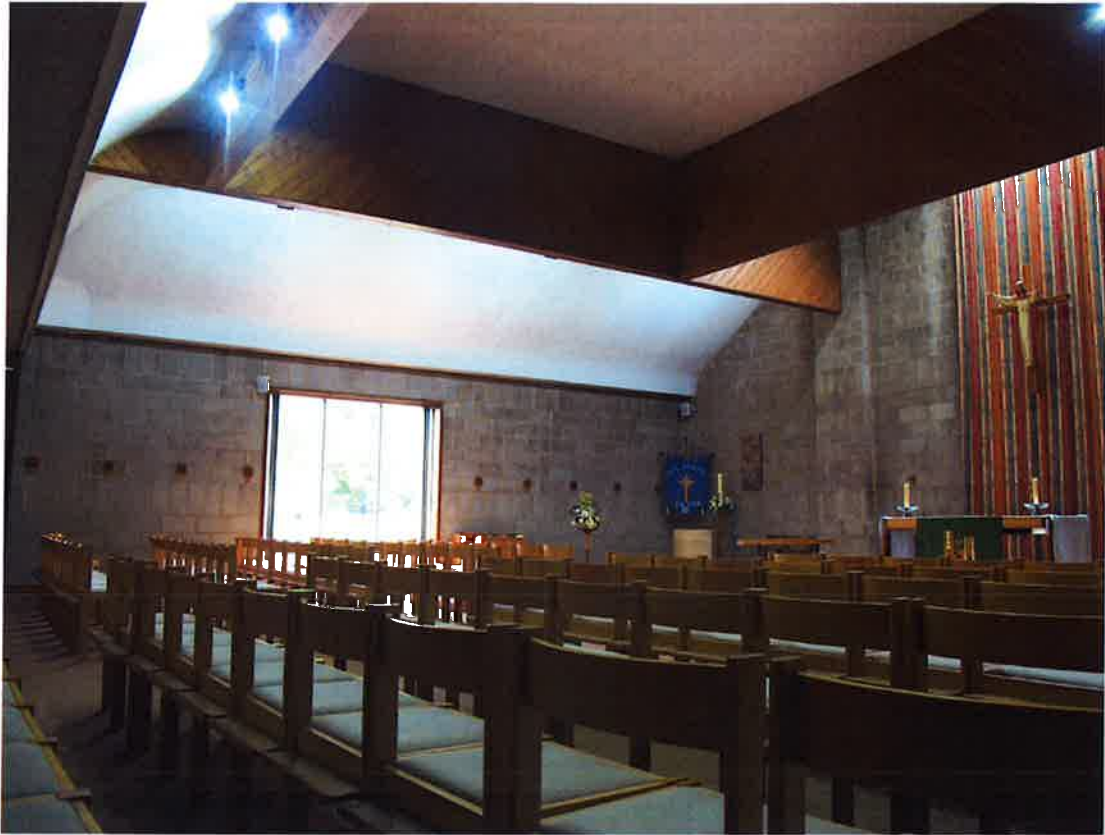
Worship area looking to liturgical north showing the only window