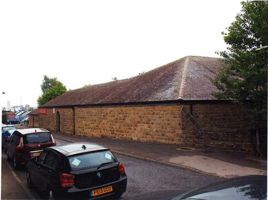
View along Cross Aysgarth Mount from the east