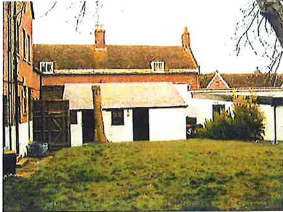
Western part of site looking to rear elevations of garage buildings