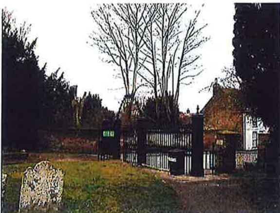
View from northern part of churchyard looking towards application site