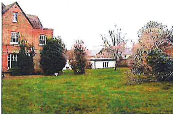
Western part of site looking towards Vicarage and outbuildings which face Quay Road