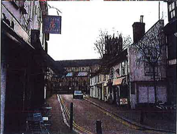
Looking south down Church Street