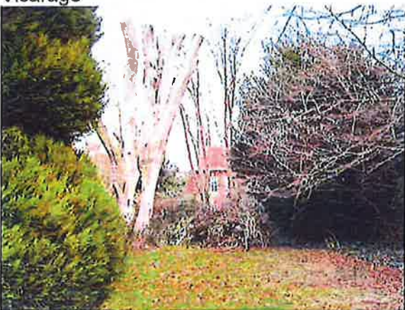
Taken centrally from Vicarage gardens looking north-east towards Church Street