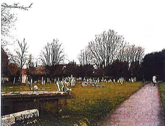
View from Priory churchyard looking towards site