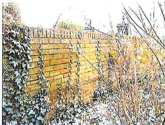
Internal view of Church Street boundary wall