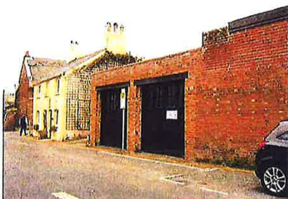
Quay Road elevation of existing garage entrances