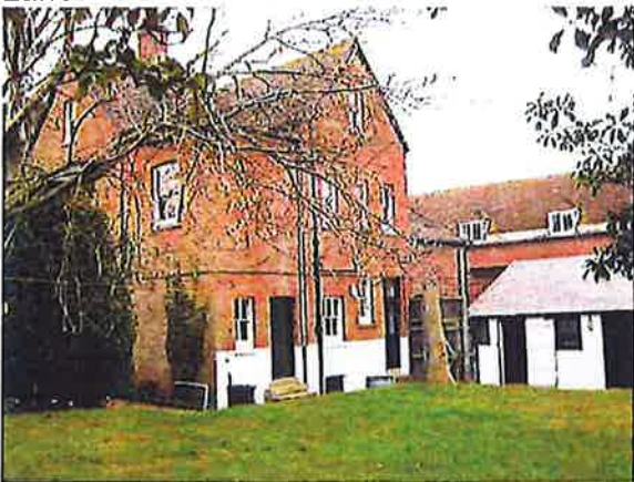
Western part of site looking towards the Vicarage