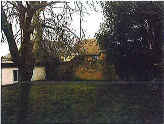
Western part of site looking towards Church Lane