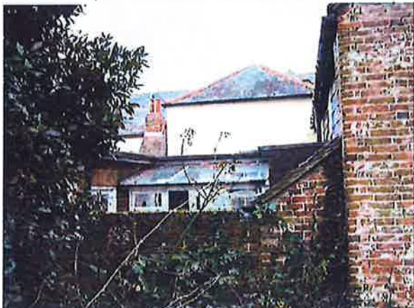
Taken from eastern part of site looking towards rear elevation of 14 Church Street