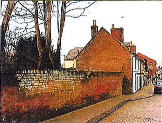
Looking at eastern boundary of site