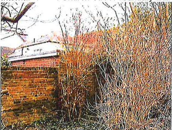
Looking towards rear extensions to 14 Church Street