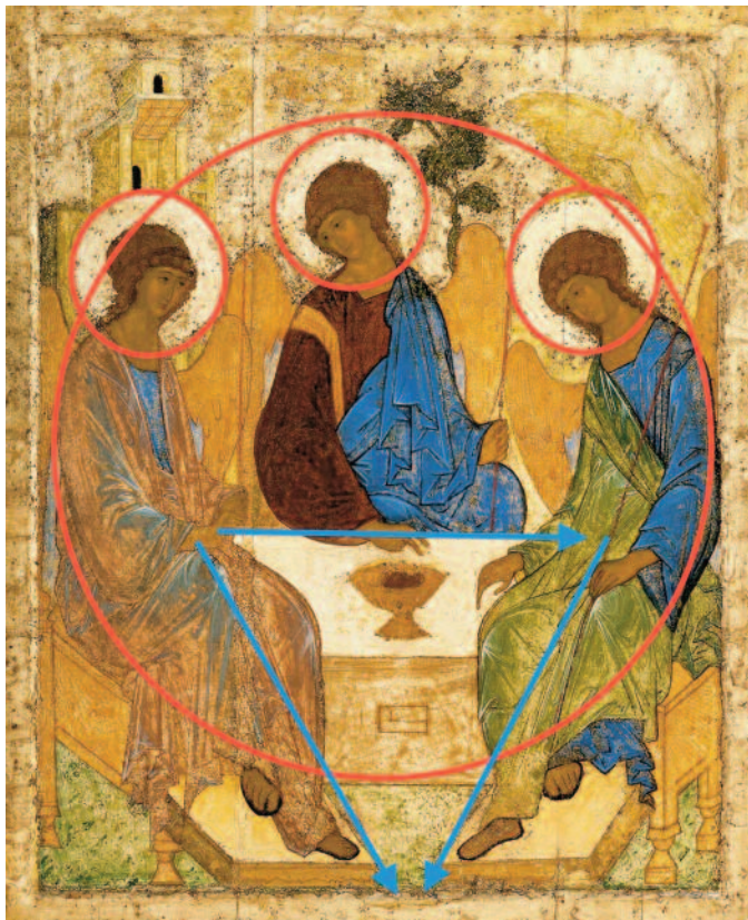
The Trinity (aka The Hospitality of Abraham), Andrei Rublev, 15th century.

children of God.” (John 1.10-12). This illustrates the importance of openness to receiving Jesus.