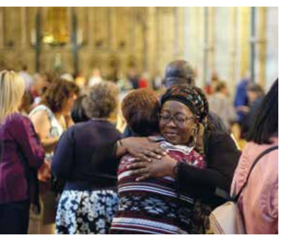
Above: Members of the congregation at the Bishop's Certificate Presentation at Southwark Cathedral in September 2017.

The Church Commissioners fund mission in churches, dioceses and cathedrals throughout the Church of England.