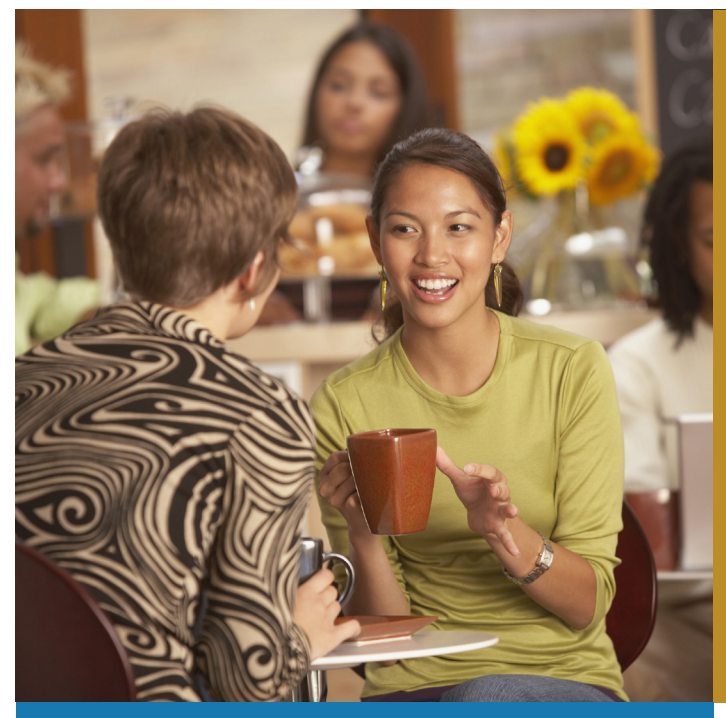
Mark 1.14-34 (NSRVA)

Something similar can be seen in the New Testament in the Greek vocabulary for 'service'.