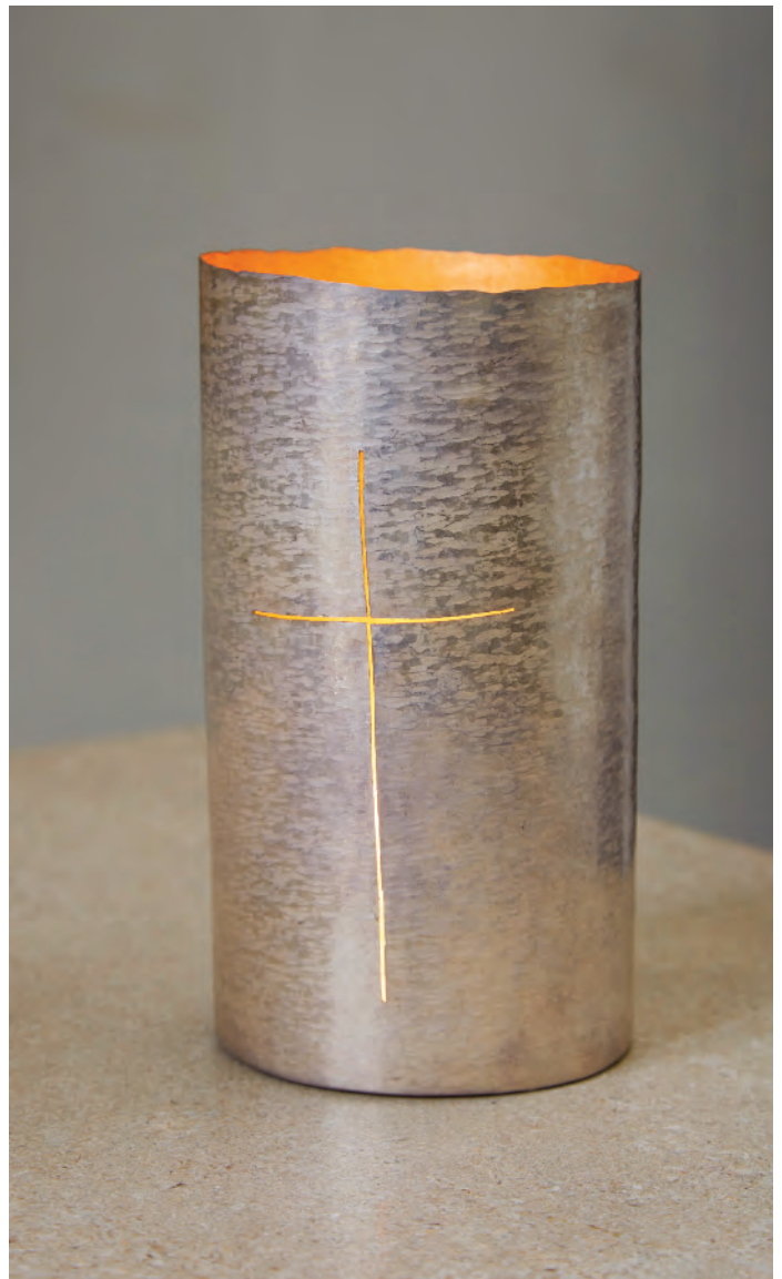
Giampaolo Babetto Candle holder for the Dick Sheppard Chapel, St Martin's-in-the-Fields, London, 2015–16, Curated by Modus Operandi

Some churches wish to include local schools, for example, in the design process. It is important that the terms of involvement are clear and that no commitment is made to use any of the suggestions in the form that they are presented. Considerable disappointment can be caused if working with local partners is not carefully considered and defined.