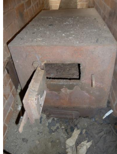
Boiler with coke still inside

The boiler and coke pits were filled with granite chippings and the nave floor compressed and leveled to take the breathable geotextile membrane, electrical wiring conduit, followed a layer of Techniclay, another layer of breathable geotextile membrane followed by a 100mm layer of limecrete which was finished with a smooth bed (screed) on which the new tiles were laid.