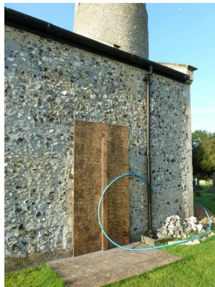
External view of unblocked north door