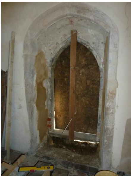
Unblocked north door

The sealed north door was unblocked ready for a new oak frame and door to be fitted. This will provide access to the temporary external toilet and will eventually be the entrance to the proposed new extension (phase 2) to the north aisle.