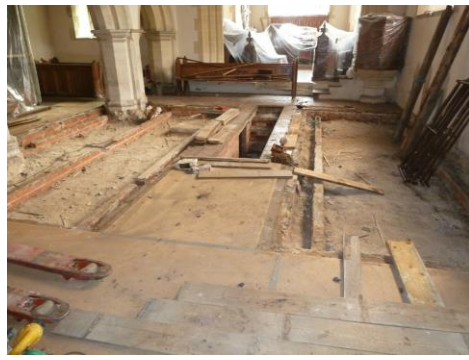
Pews and platforms removed exposing the voids

The first phase of the work involved the removal of the Victorian pews. All were pre-sold to members of the local community for £120 each. Some were found to have dry rot and in need of repair, most had wood worm which would have to be treated. Two pews were retained for use within the Church.