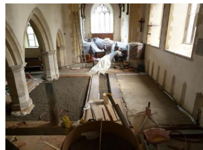
Limecrete slab on right