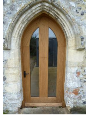
Viewed from the outside