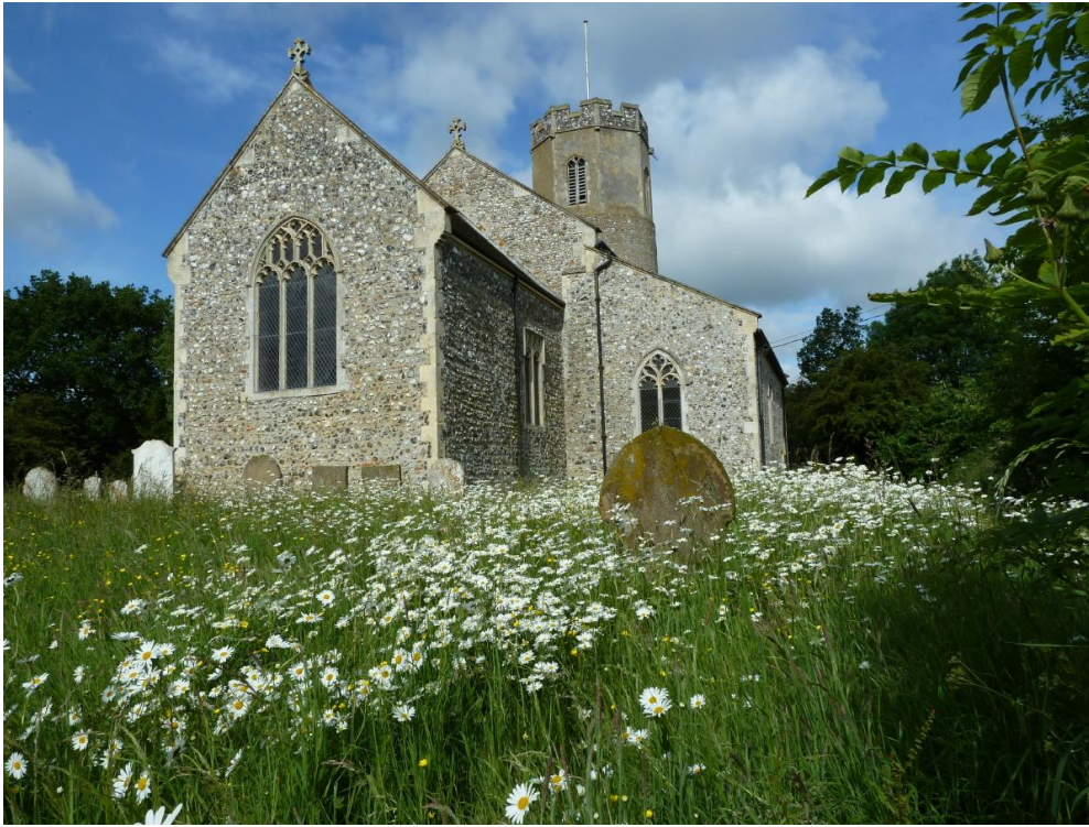
St. Peter's Church, Swainsthorpe