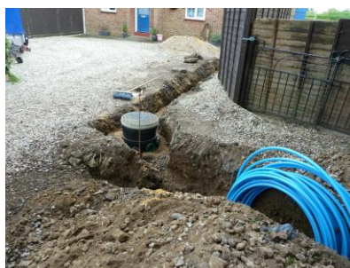
Inspection Chamber 23, Church Road