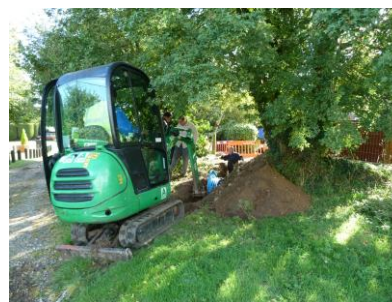
Digging trench through Church boundary