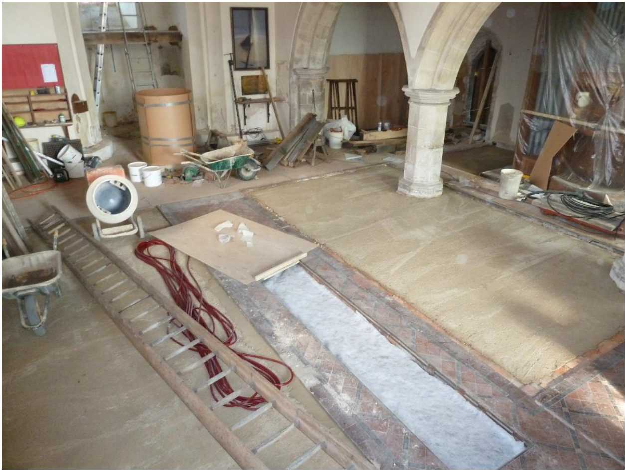
The nave and north aisle floors filled and leveled ready to receive the final screed and tiles

The filling and leveling of the nave and north aisle floors was completed by 30 th August. The limecrete needed time to set and dry out before the final screed could be applied.