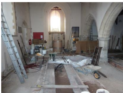
Boiler house and coke store filled with granite chippings

The boiler and coke pits were filled with granite chippings and the nave floor compressed and leveled to take the breathable geotextile membrane, electrical wiring conduit, followed a layer of Techniclay, another layer of breathable geotextile membrane followed by a 100mm layer of limecrete which was finished with a smooth bed (screed) on which the new tiles were laid.