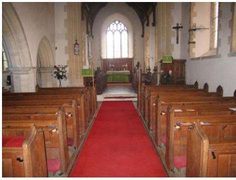
The nave before work started