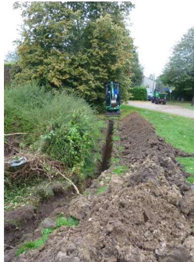
Water Pipe to Church