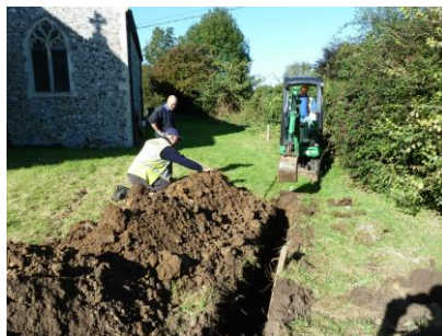
Archeologist at Work