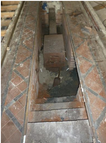
Victorian coke burning boiler Located under the central Aisle of nave

The old Victorian coke boiler (weighing almost half a ton) and a quantity of fuel were removed from the boiler and coke store located under the central aisle of the nave. The flue from the boiler ran under the floor to the vestry and then up through terra cotta pipes, previously warmed by lighting the Victorian warming stove, to the tower roof where the fumes were dispersed.