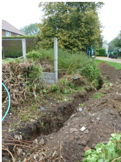
Location of the Water Meter

The mains water supply would come from a point in Church Road and connected to the Church water supply pipe and meter which was located on the edge of the boundary of the new house being constructed opposite the village notice board. An Easement was obtained from Saffron Housing, owners of 23, Church Road, to connect to the mains sewer of this property.