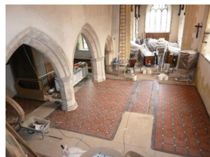
Day eleven Floor tiling and grouting completed

The floor tiling was completed on 19 th October 2012. These photographs show the protective covering placed over the existing tiles which would eventually be removed.