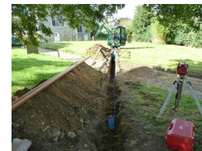
Water and drainage going across the Churchyard