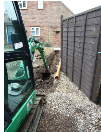
Drainage connected to 23, Church Road