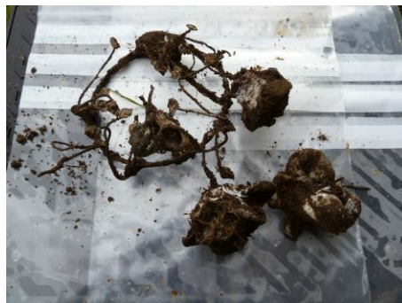
Child's headdress with china roses