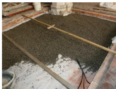
Membrane and Techniclay