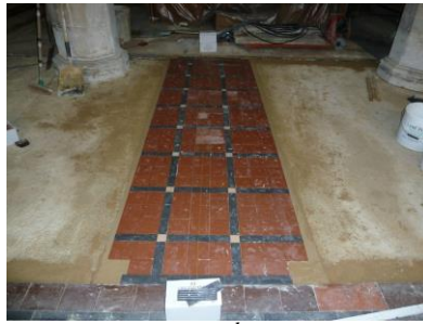
Work started-12 th August 2012