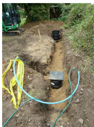
Inspection chamber with branch to the temporary external toilet

The mains water supply and drainage pipes run across the Churchyard to an inspection chamber located on the edge of the boundary of the proposed new extension close to the hedge. The temporary external toilet will be located in almost the exact position of the toilet proposed in the new extension (directly opposite the north door) so the pipe work will be accessible when the decision is made to extend the north aisle (phase 2).