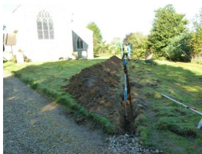
Across the Churchyard