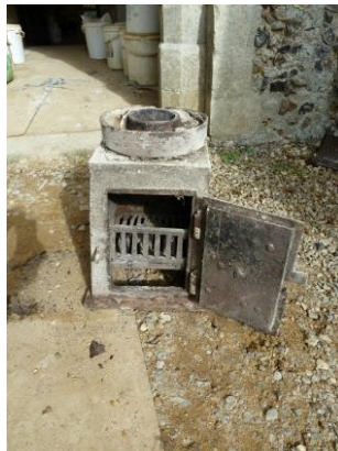
Victorian flue warming stove removed from the vestry