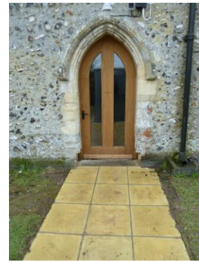
Pathway to the toilet

Work started on trenching for the water supply and drainage on 1 st October 2012 and was expected to take 6 working days. An Archeologist would be in attendance when the ground works reached the Churchyard.