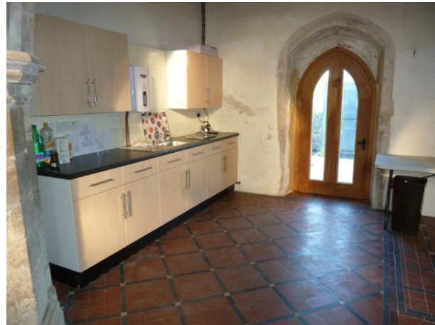
Kitchen, water heater and pipe work in position Kitchen complete with new boiling water unit

The new electrical radiant down heaters replaced the old and were more eco friendly and efficient. A new main electrical service board and trip switch were fitted and new wiring served the heaters, plug sockets, kitchen, outside toilet and outside socket and light.