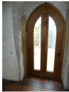
New oak door fitted