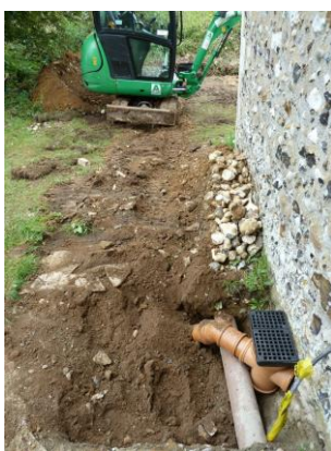
Connection to Church