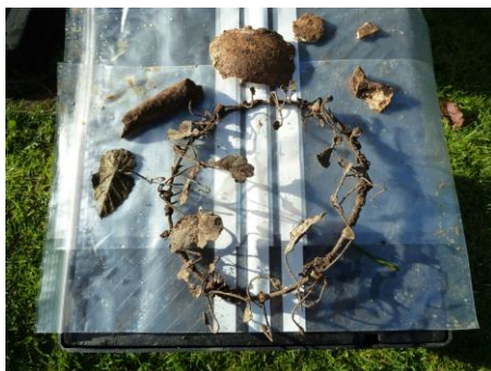
Adult headdress with metal leaves

Fortunately no graves were disturbed during the trench digging but there was evidence of burials as the dig went through the Churchyard. A grave (perhaps two) was discovered along the boundary opposite the north aisle close to the hedge. Two headdresses (one belonging to a child and one to an adult) were recovered from the trench at two separate locations along this part of the dig. The archeologist suggests that they could be 200 to 300 years old borne out by a small headstone dated 1817 which was recovered from the trench in the same area. The tiaras have been taken away for closer examination and will be returned to us with a full report at a later date. The archeologist also suggested that the burial ground could have extended into, what is now the village green.