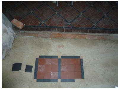
New design layout – square

Work started on tiling the nave and north aisle floors on 12 th August 2012 and was expected to take up to 14 working days to complete. The new tiles were carefully chosen by the Architect to match the colours of the existing. The new design layout (square) of the floor tiles was to be sufficiently different from the existing tiles (angle) to show the historical change over time. The original tiles, probably Victorian, were manufactured by Maw & Company of Broseley.