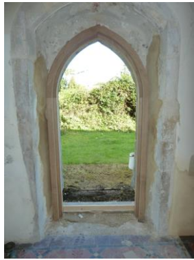
Oak frame in position

The new north door and frame, made out of European Oak, was prepared ready to fit. The frame was offered up first followed by the door which has two clear toughened glass panels.