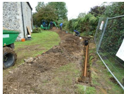
Trench to proposed extension Church kitchen and toilet

The mains water supply and drainage pipes run across the Churchyard to an inspection chamber located on the edge of the boundary of the proposed new extension close to the hedge. The temporary external toilet will be located in almost the exact position of the toilet proposed in the new extension (directly opposite the north door) so the pipe work will be accessible when the decision is made to extend the north aisle (phase 2).