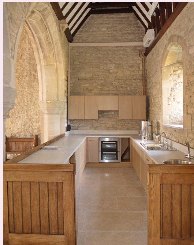
Completed kitchen at Stadhampton

At the time of writing, key roles on the management committee include a Churchwarden, a Parish Councillor and the Booking Clerk; the rest of the committee (of eight) is made up of people largely involved in the hall's user groups and the Vicar has an open invitation to attend any meetings. The management committee is guided by a document defining roles and responsibilities. These include: how running costs are shared; fundraising and apportionment of any profits and the maintenance of the fabric of the building, etc.