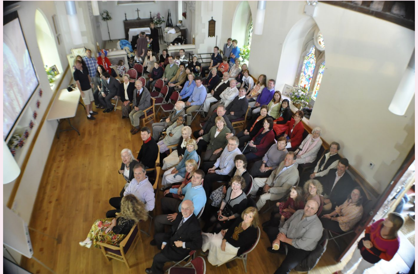
Watching the Royal Wedding 29th April 2011

The Village and church share the same website www.fernham.info which includes an online booking system.