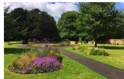
Therapeutic Garden at St Mary's, Lewisham

Green Health Awards - The benefits of engaging with the natural world for mental, physical and spiritual health is increasingly recognised. These new awards, run in partnership with the Church Times, will recognise churches who are engaging with this work. For example, those communities which make best use of their outdoor space to promote the links between natural environment and our health. The Green Health Awards will be launched on the 4 th May and will culminate in a conference on 2 nd October. We're currently looking for exciting existing projects to be used in publicity to launch the awards, let us know which projects inspire you.