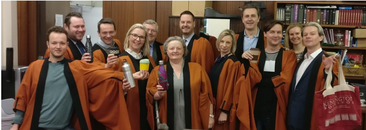
The choir of St Bride's (London Diocese) tackling Plastic-less Lent – find out more about their experience here

'Care for God's creation and the people who inhabit it is instrumental to the life of faith'.