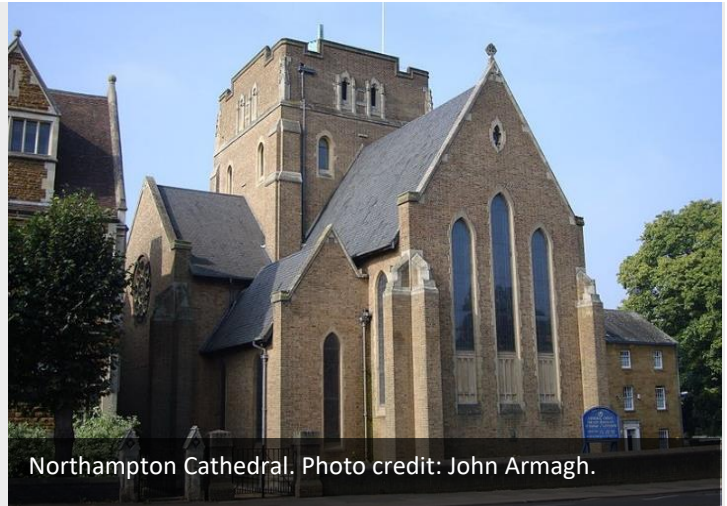
Northampton Cathedral.

The stained-glass repair works are fully complete and involved firstly, carefully removing each panel and cleaning with de-ionised water. Cracked and damaged sections were then identified and repaired using copper foil and resin bond. Panels which were beyond repair were replicated using hand painted and kiln firing techniques to emulate the original design as close as possible. Final works included re-leading and cement sealing of tracery panels. In accordance with the grant offer, a full specification by an architect accredited in building conservation a glazing survey were prepared, and glazing works were carried out by an accredited glass conservator.