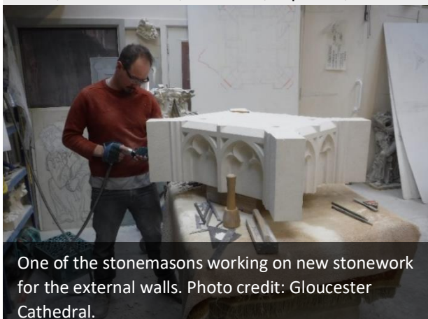
One of the stonemasons working on new stonework for the external walls.