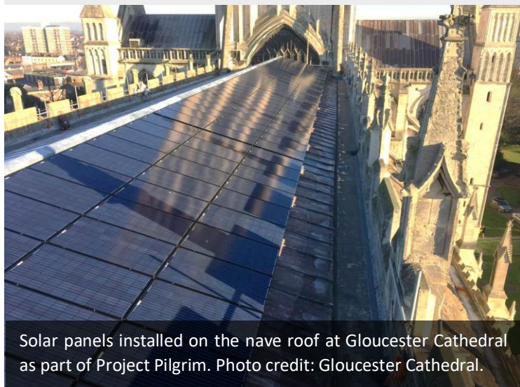
Solar panels installed on the nave roof at Gloucester Cathedral as part of Project Pilgrim.

The solar panels on the nave roof generated considerable publicity for the cathedral and attracted large numbers of visitors from green and sustainability groups. The projects helped crystallise the Cathedral's thinking about their First World War commemorations and enabled them to focus on planning a wide range of interesting events.