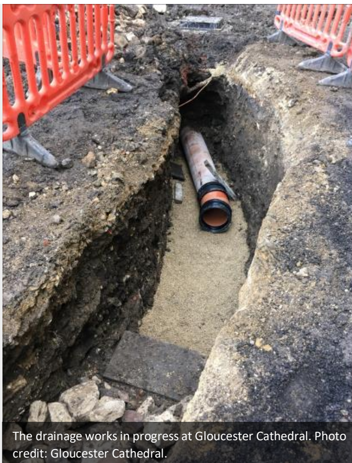
The drainage works in progress at Gloucester Cathedral.

Gloucester Cathedral is architecturally hugely varied, consisting of a Norman nucleus dating from 1089 with additions in every style of Gothic architecture. The cathedral has in the region of 400,000 people that come each year to visit or take part in its services, events and activities