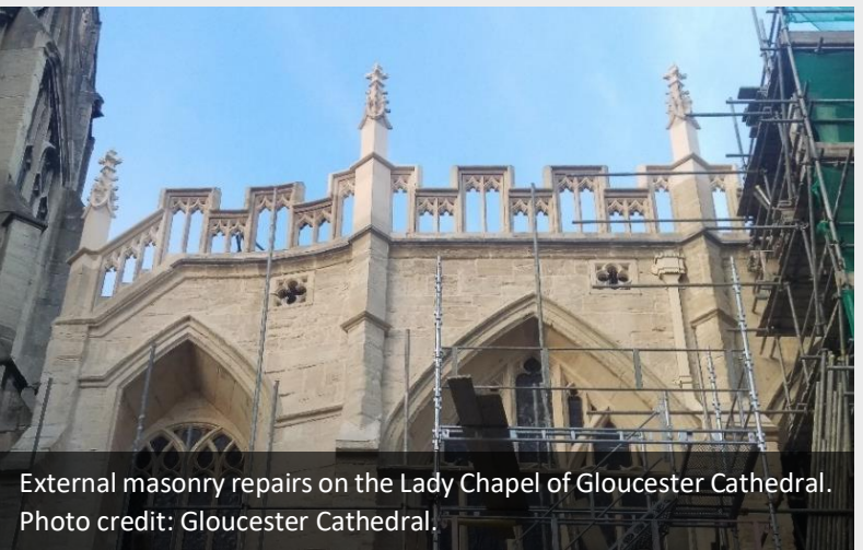
External masonry repairs on the Lady Chapel of Gloucester Cathedral.

Work began in August 2014. The in-house works team undertook the masonry repairs and Chapel Studio Stained Glass, Hertfordshire, removed, repaired, re-leaded and re-fitted the stained-glass. The works were completed in March 2016. The award of funding for the second phase of works to follow directly on from the first phase allowed the cathedral to make cost savings on contracting this work.