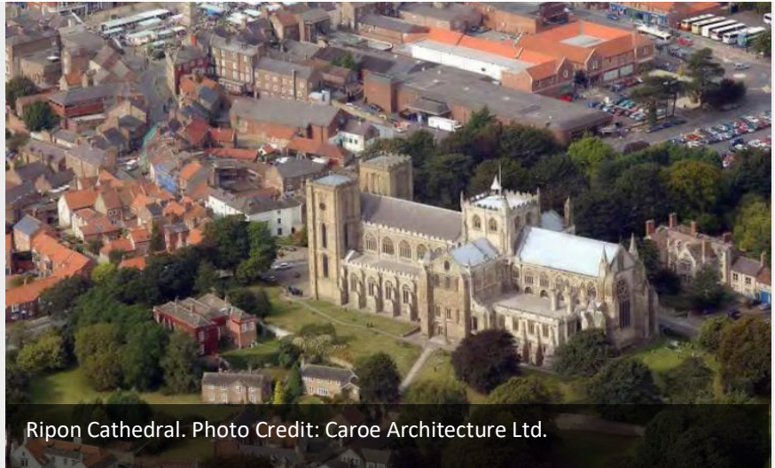
Ripon Cathedral.

As a continuation of the earlier north transept project, essential work was needed to stabilise, repair and renew stonework at the upper levels of the north quire and north transept at the east (presbytery) end of the cathedral. The renewal of asphalt guttering, enhancements to the rainwater disposal system, and providing access for maintenance and the Fire Service at this high level of the building were other urgent requirements.