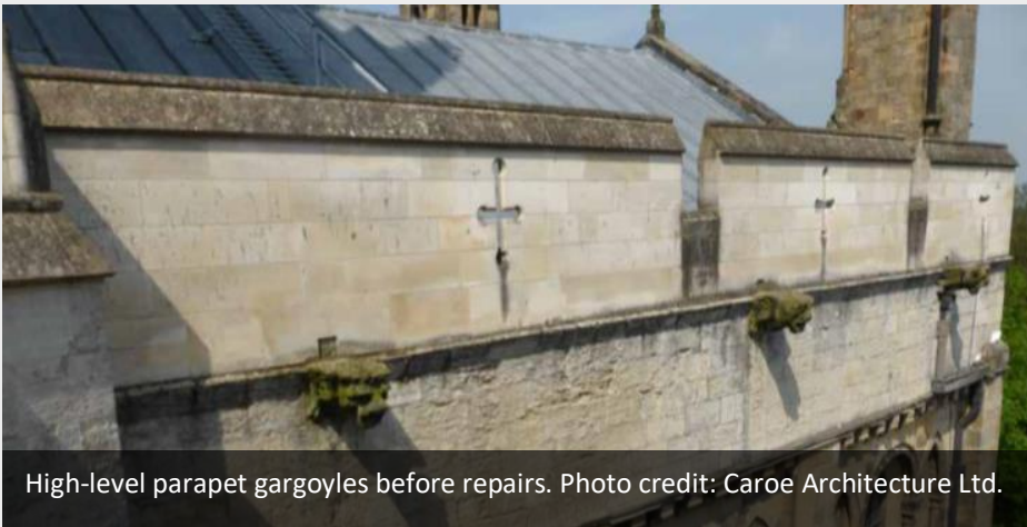
High-level parapet gargoyles before repairs.

The work involved a programme of stonework stabilisation, repair and renewal to the walls and flying buttresses to the North Choir clerestory, as well as to pinnacles and window tracery. The Cathedral brought the stonemasons in-house which saved time and money across their two stonework projects in the same area of the Cathedral. The works are now successfully complete and will not need any further work for at least 25 years.