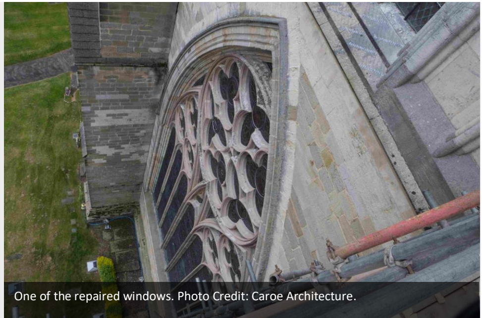
One of the repaired windows.

Ripon was a great collegiate church, one of the three mother churches of the great archdiocese of York, but was only made a cathedral in 1836. The church is mainly thirteenth and fourteenth century, with significant periods of rebuilding, including after the 1450 collapse of the central tower which was never fully rebuilt.