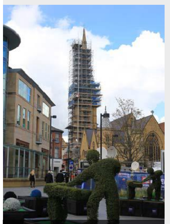
The scaffolding was exceptionally complex.

The works are fully complete and included replacing iron cramps and dowels with new stainless-steel variants, repointing of the spire with lime mortar, pinnacle repairs and re-gilding of the weather vane. The second phase of repair works was complete by June 2016. They included dismantling and rebuilding the upper six metres of the tower to enable the holding-down rod and cross tree to be replaced in stainless steel. The scaffolding proved