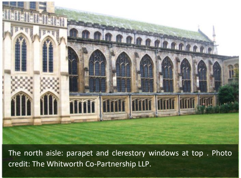
The north aisle: parapet and clerestory windows at top .

In 2013 the cathedral had repaired its mediaeval south aisle roof, but was unable to afford to address a similar situation on the north side. The 2011 Quinquennial Inspection had highlighted the advanced state of structural deterioration in the north aisle roof and of the clerestory windows, together with a number of areas needing urgent stonework repairs. Leaks, especially in the heavy downpours which were increasingly occurring, continued to be a problem, and temporary repairs did not offer an adequate long term solution. It was clear that the north aisle roof needed to be re-leaded, and extensive works were required to the clerestory, at a cost in excess of £500,000.