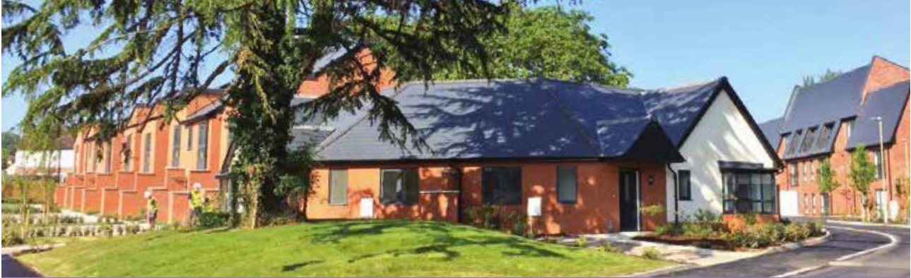
The new St Aldate's development.

A missional approach to church land and assets