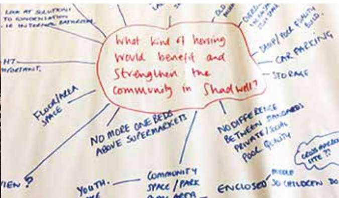
A meeting with parents at the local primary school about what kind of housing would strengthen the community