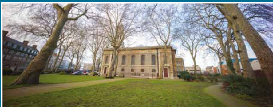
St John's, Hoxton

In the next two chapters, several key themes and broader learning points around how the Church uses its surplus land assets for affordable housing are explored. Whilst the Innovation Fund project in Chelmsford diocese is far from complete, it is an inspiring story of what is possible when churches are supported by local authorities to release surplus land for affordable housing at the same time as redeveloping their own facilities. The story of St John's Church, Hoxton, whilst sharing some themes, highlights some of the barriers facing churches wishing to develop their land assets for affordable housing.