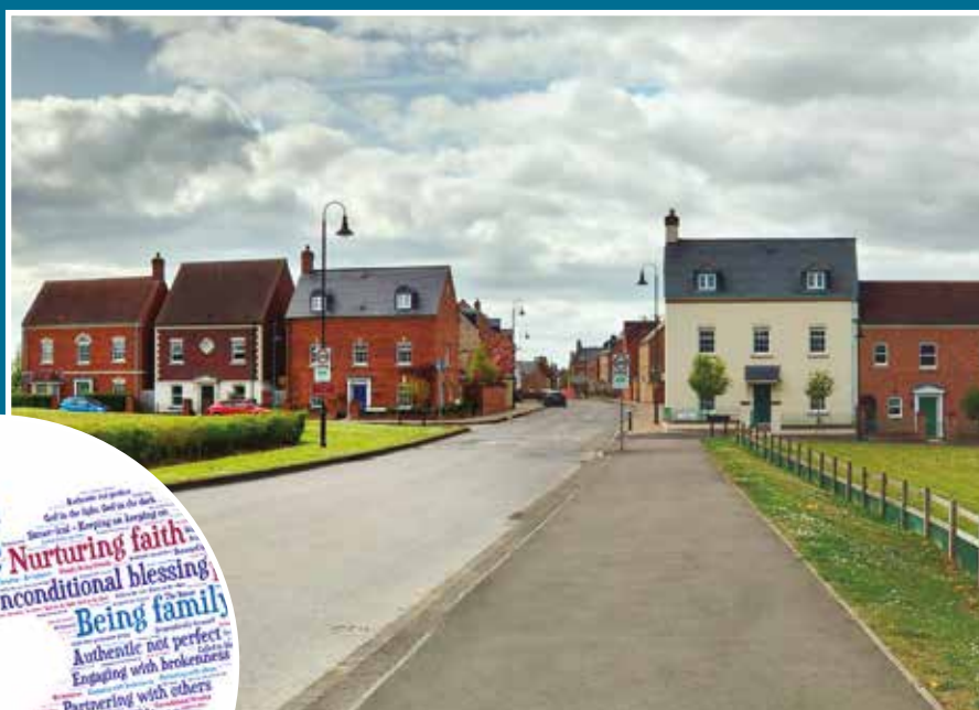
Wichelstowe, an urban extension on the edge of Swindon

The New Housing Hub is a national, cross-denominational network that seeks to connect, equip, resource and inspire Christians to engage positively with new housing communities in a context in which building new homes is a priority.