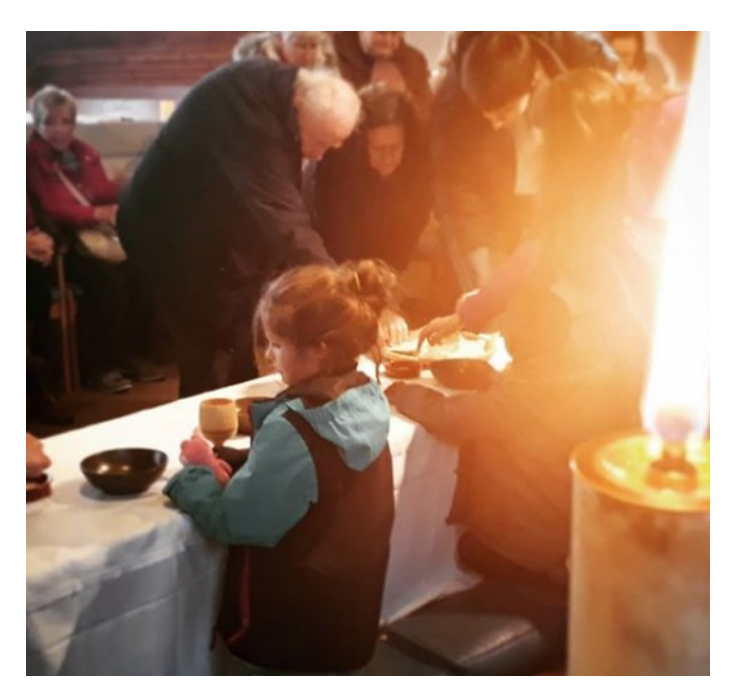
Good Friday at St Paul's church Ireland Wood