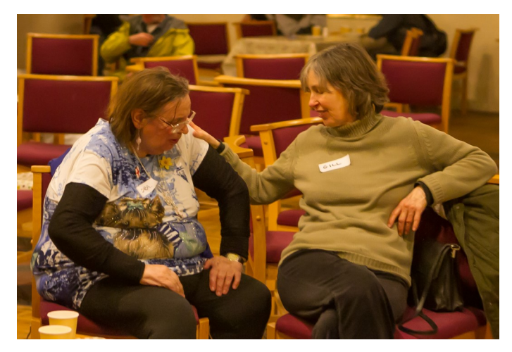
A small group in Canterbury's Ignite project