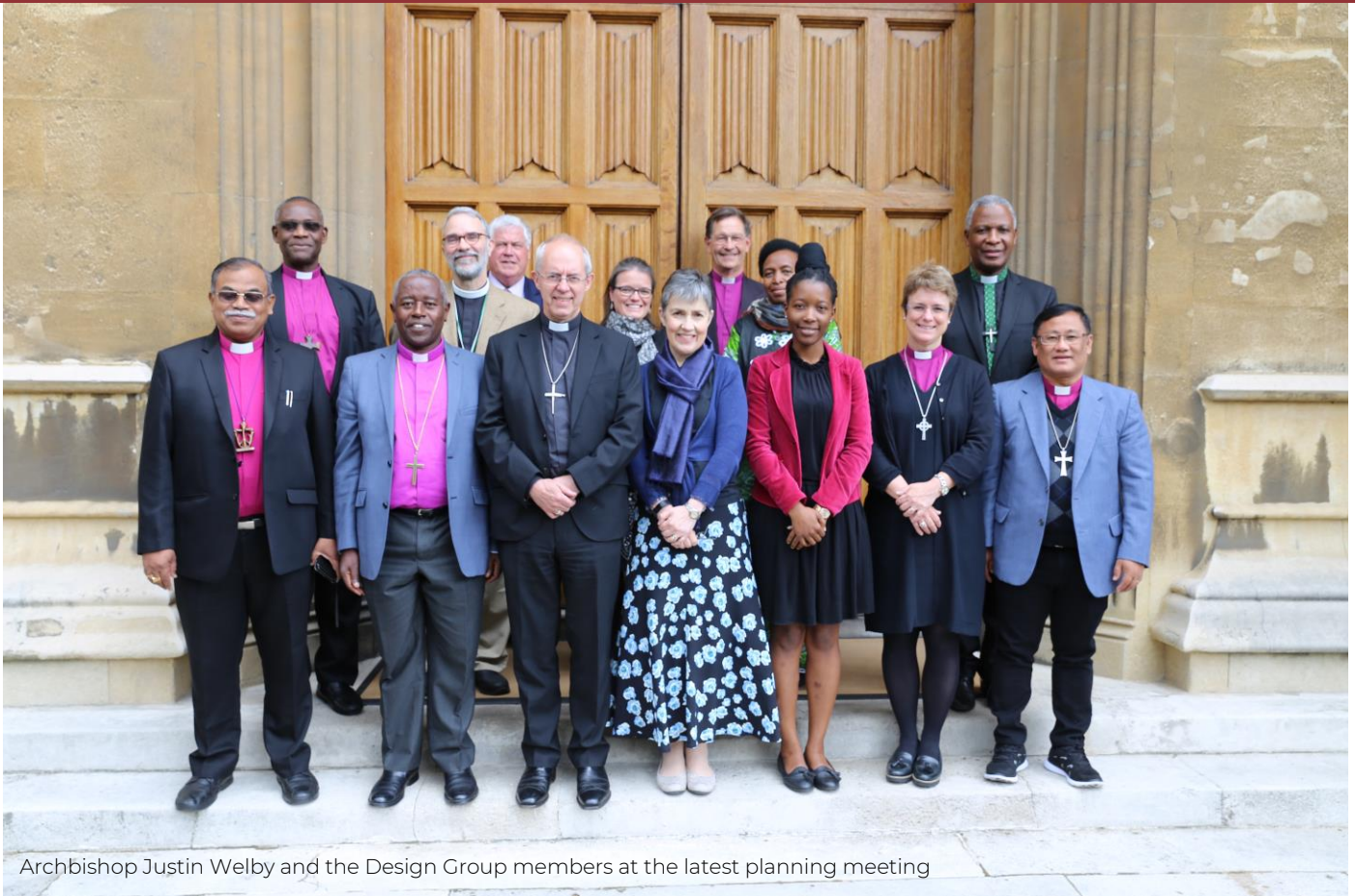
Archbishop Justin Welby and the Design Group members at the latest planning meeting