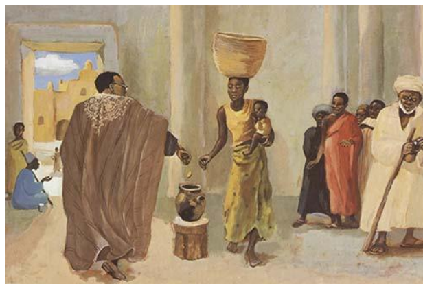
The Widows Mite by Jesus Mafa

The story of the generous widow Luke 21: 1-4