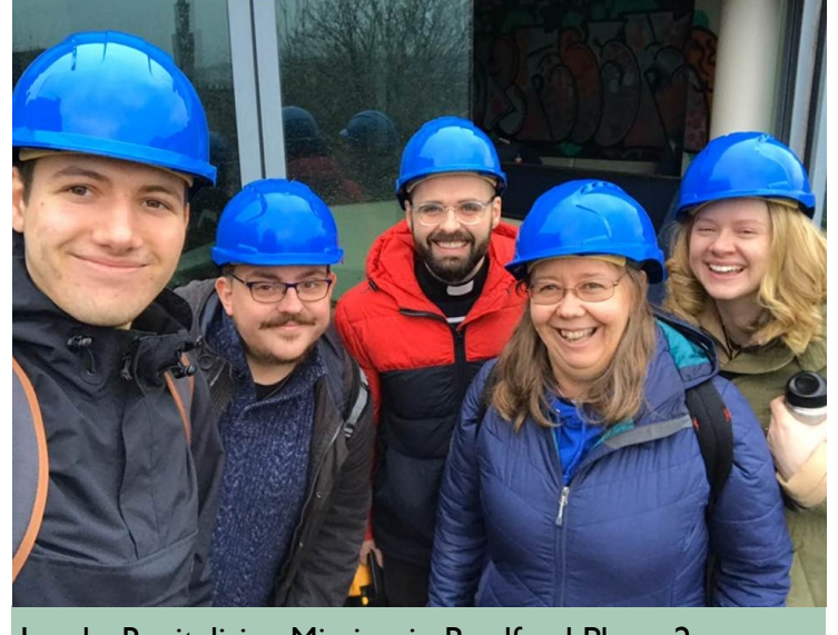
Leeds: Revitalising Mission in Bradford Phase 2