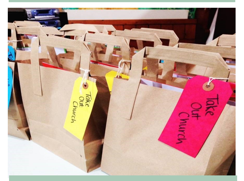
Bags for 'Take out church'