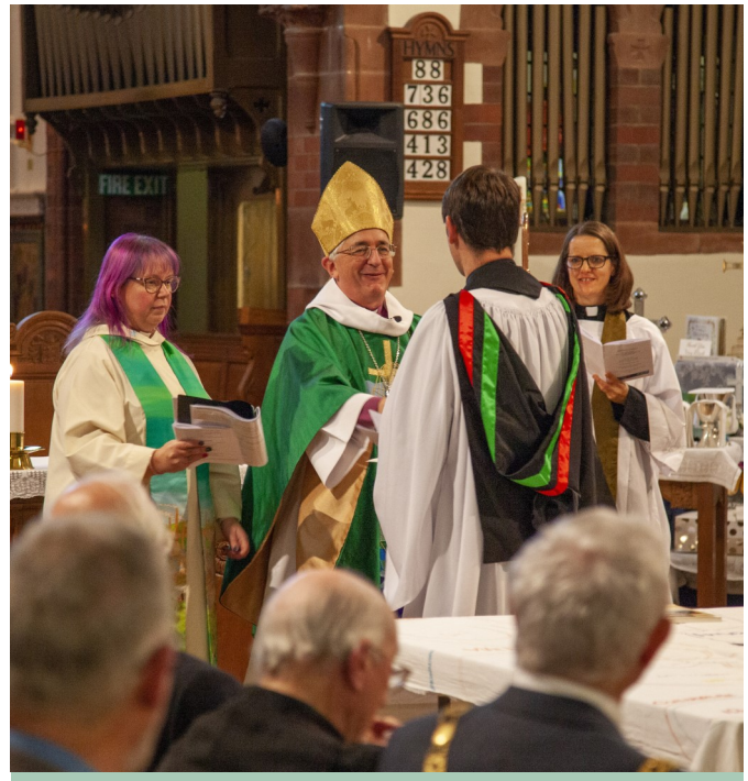
Lichfield: Telford New Minster