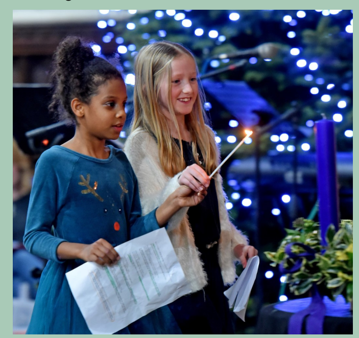
The carol service at Leicester Cathedral

In December the diocese hosted its Global Carol Service in Leicester Cathedral which gathered Christians from different cultures and ethnicities to discuss their Christmas traditions and to discover their universal shared experience of Christians celebrating Christ's birth.