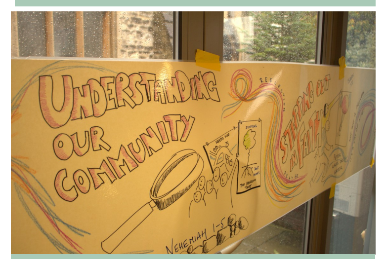
The Mother's Union; Metamorphoses project, awarded 2019