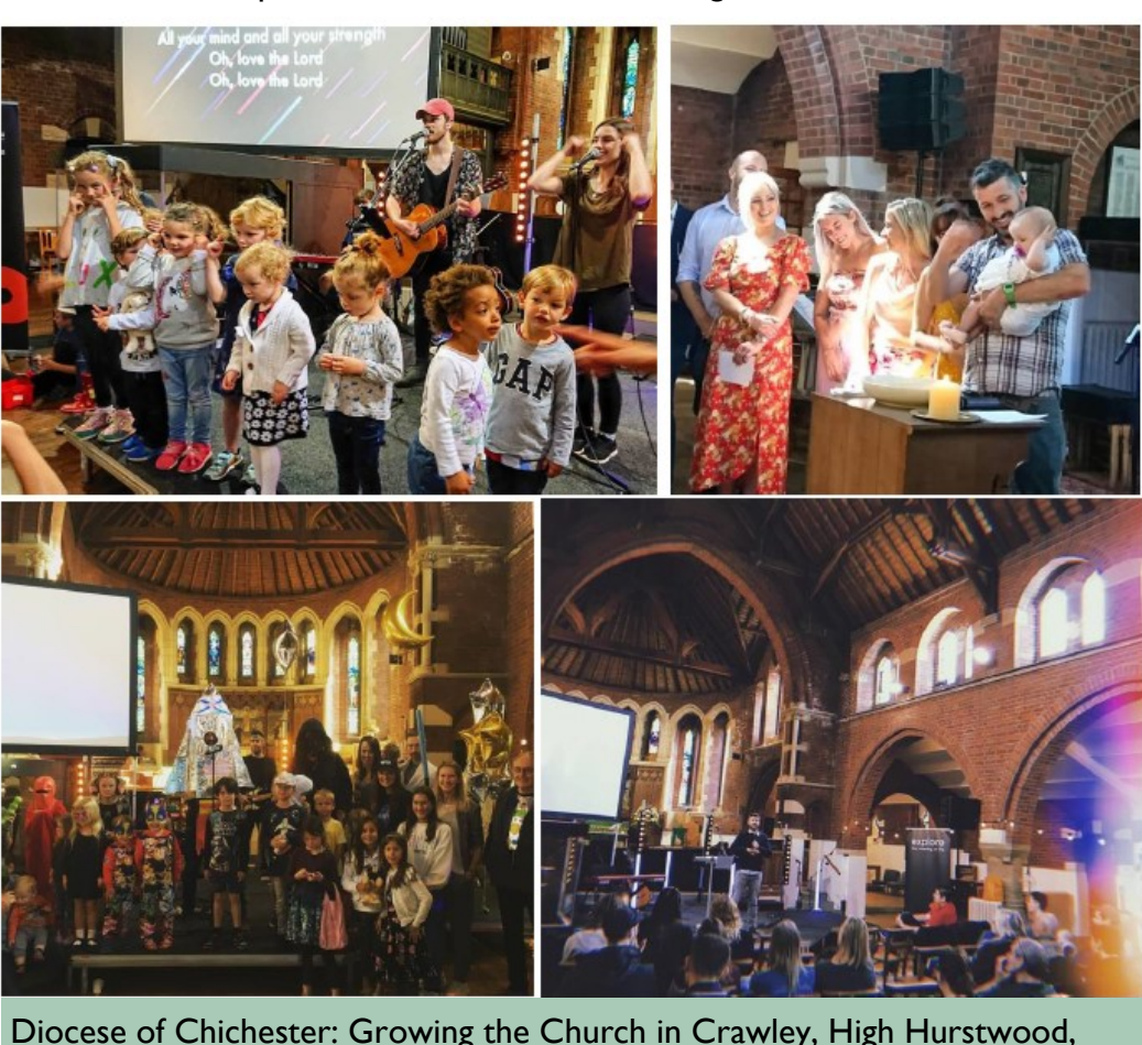
Diocese of Chichester: Growing the Church in Crawley, High Hurstwood, Brighton & Hove, awarded January 2017.

The first projects supported in the 2014-16 funding period are now beginning to reach completion. Staff are working with two dioceses to trial an approach to the final evaluation of these projects to help our understanding of how best to capture the outcomes and learning from them.