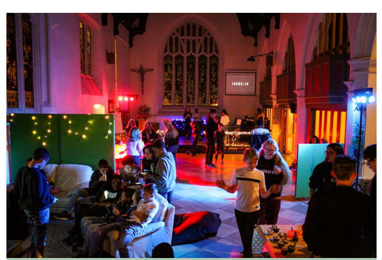
Diocese of London: Capital Youth, awarded June 2017

previously awarded SDF which are focusing on mission and ministry to children and young people. Manchester diocese's Children Changing Places project, which was awarded SDF in June 2018 to engage with children and families at points of transition in their passage through school, is delivering regular discipleship activity in 28 primary schools and has recently launched ten new distinctively Christian toddler groups.