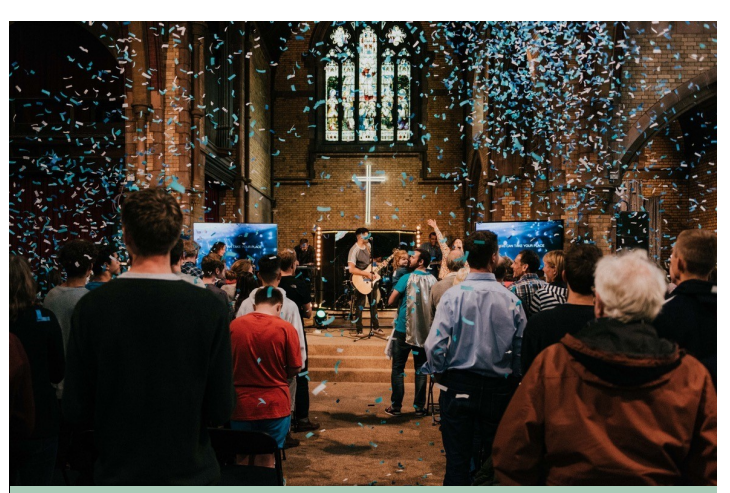
Exeter: Growing Mission in the City of Exeter