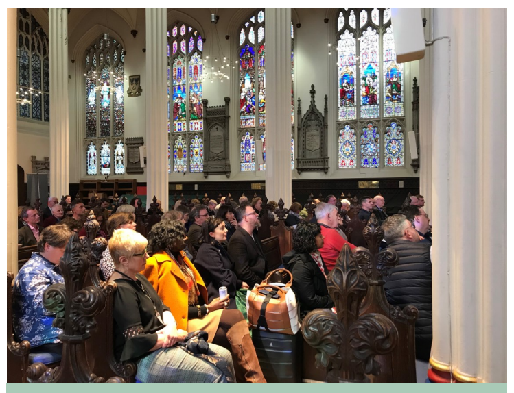
St Martin-in-the-Fields; HeartEdge project, awarded 2019

From 2020 applications for non-diocesan funding has closed, instead organisations will be able to apply for Innovation Funding to develop their ideas.