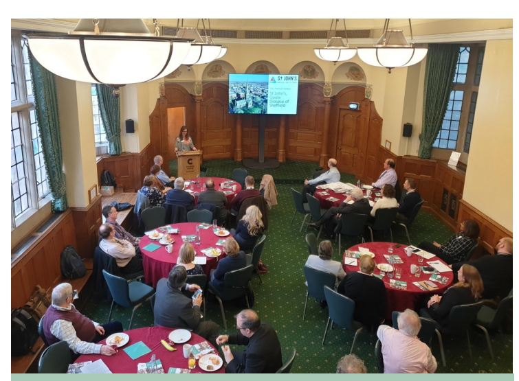
The General Synod fringe meeting on Mission in Deprived Communities

SDU staff regularly communicate insights from the SDF programme to dioceses in supporting the development and delivery of their programmes. We are also encouraging SDF project leaders in dioceses to share learning on particular issues with their counterparts elsewhere, e.g. through workshops. A seminar about SDF projects working in deprived communities took place at the 2020 General Synod. This heard learning from three projects in the dioceses of Canterbury, Blackburn & Sheffield.