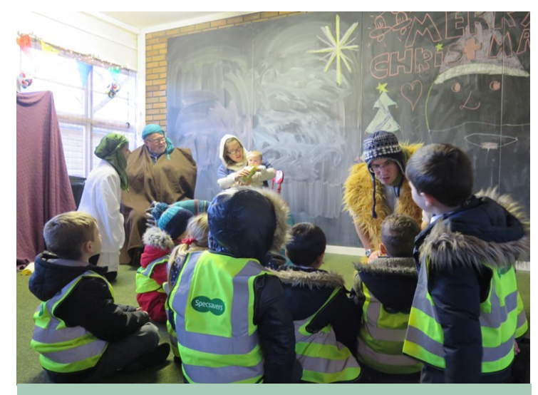
The 'through the keyhole' Christmas story