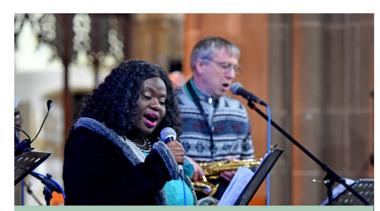
Diocese of Leicester: Enabling BAME Mission & Ministry