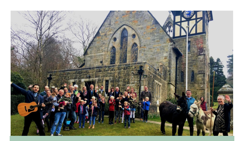
Diocese of Chichester: Growing the Church