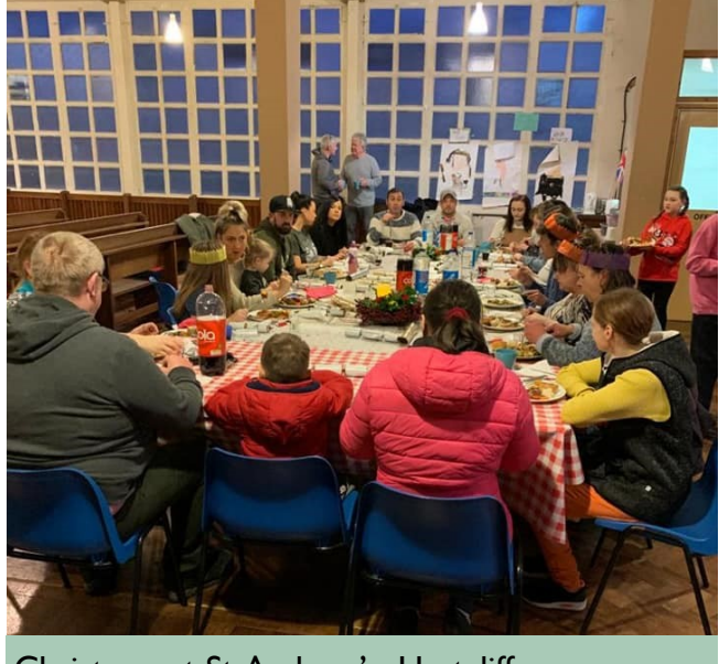
Christmas at St Andrew's, Hartcliffe

This group, effectively a fresh expression of church, is aimed at people who might not feel comfortable in a traditional Sunday service; many are unemployed and may struggle with low levels of literacy. Initially around 10 people came along