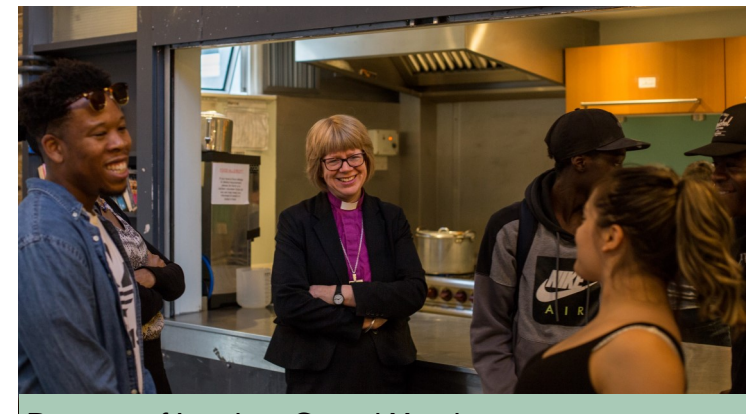
Diocese of London: Capital Youth