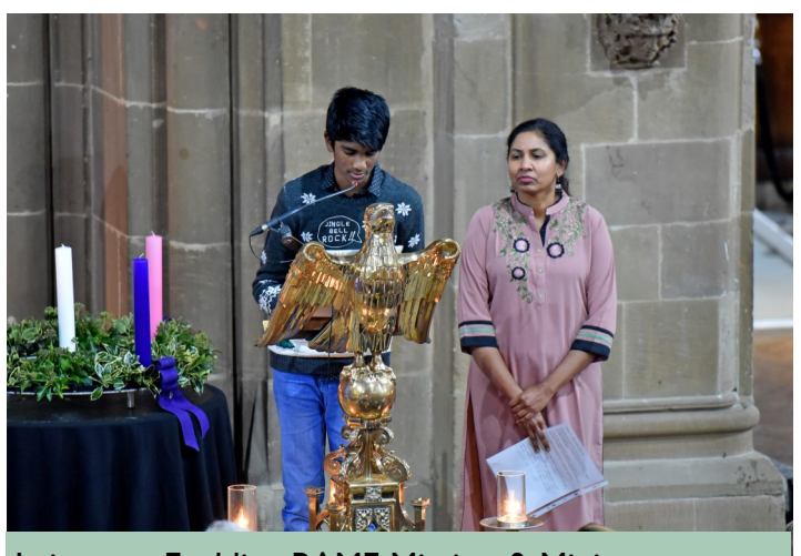
Leicester: Enabling BAME Mission & Ministry