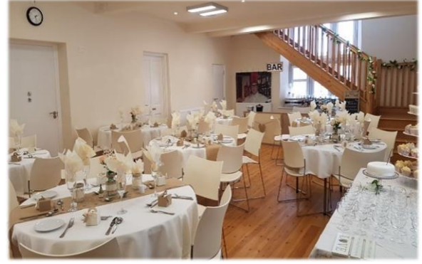
A function in Trinity Rooms

Since then, Trinity Rooms have been completely refurbished to provide two well equipped spaces (with kitchens) for a variety of church and community needs; our tagline, Making Room for the Community .