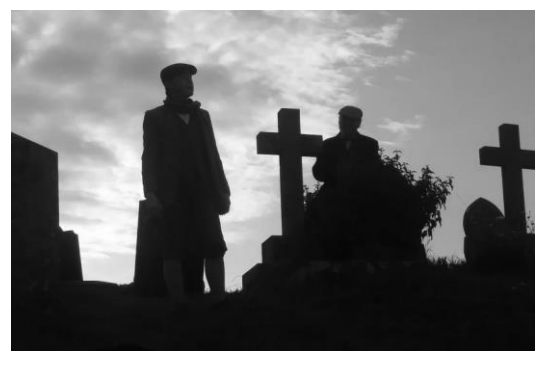
A scene from the 2019 Dead Famous in the Churchyard