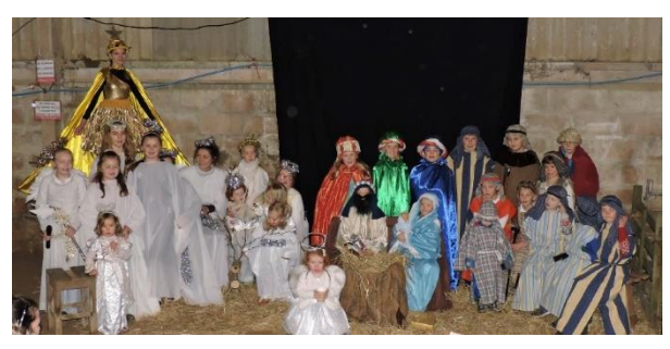
Nativity in the Barn 2019

There is a monthly service of Holy Communion and additional services for a Gift Day, Harvest Festival (followed by a splendid Harvest Supper) and a Christmas celebration.