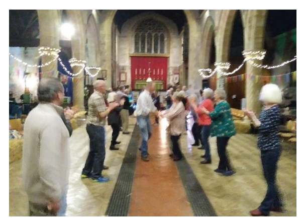
The Annual Barn Dance in St Peter's

The congregation is more mixed than at Holy Trinity and St Peter's has always enjoyed a reputation for its welcome and inclusiveness. Its proximity to Ilfracombe Junior School and the openness of the building (it was never given fixed pews!) make it an ideal resource for the School and we are presently seeking to make access easier. We also hold larger events here including an annual Barn Dance and Burns' Night Supper. In the past we have hosted concerts (everything from rock to oratorio) and theatre.