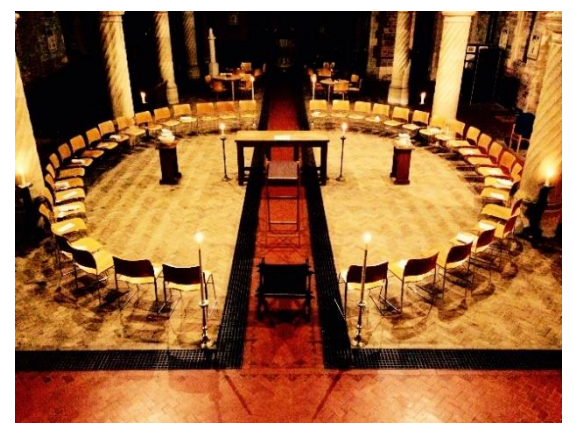
Adapting the space for Maundy Thursday