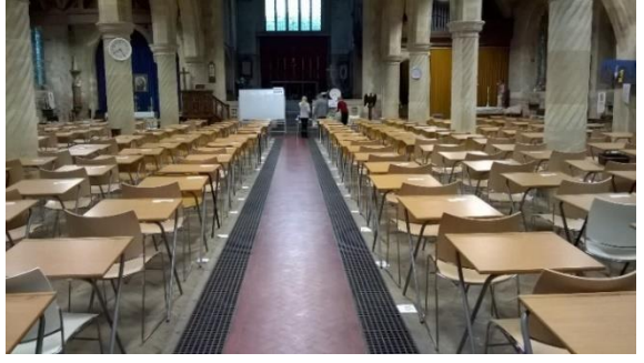
St Peter's used for public examination 2018

St Peter's was leaking like a sieve but, with its location next to the Junior School and in the most densely populated residential area of the town, we wished to make it A Heart for the Community. With its large