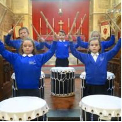
Music is important at the Junior School. Here, Taiko drumming at a celebration

performances, and even for the mock and public exams for Ilfracombe Academy.