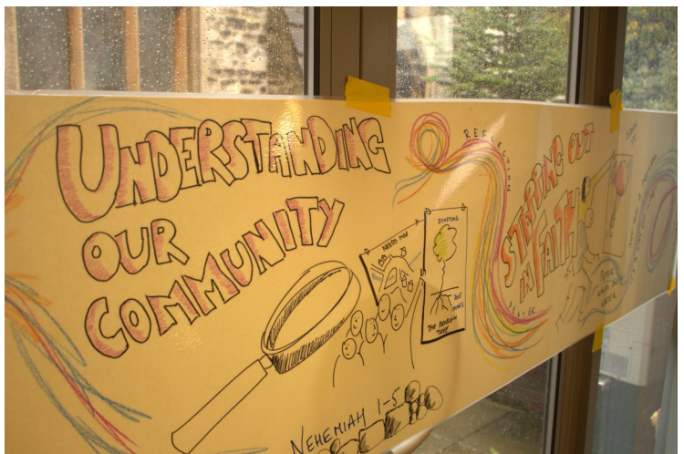
The Mother’s Union; Metamorphoses project, awarded 2019