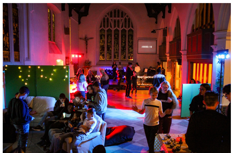
Diocese of London: Capital Youth, awarded June 2017

previously awarded SDF which are focusing on mission and ministry to children and young people. Manchester diocese's Children Changing Places project, which was awarded SDF in June 2018 to engage with children and families at points of transition in their passage through school, is delivering regular discipleship activity in 28 primary schools and has recently launched ten new distinctively Christian toddler groups.