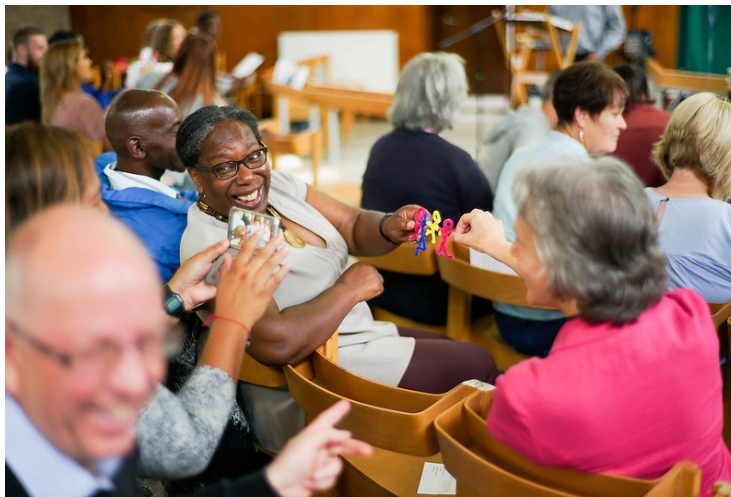
Birmingham: People & Places Phase 2; Children and Family Missioners and church planting in Langley