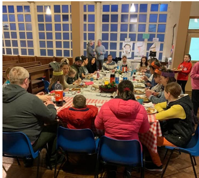
Christmas at St Andrew's, Hartcliffe

This group, effectively a fresh expression of church, is aimed at people who might not feel comfortable in a traditional Sunday service; many are unemployed and may struggle with low levels of literacy. Initially around 10 people came along