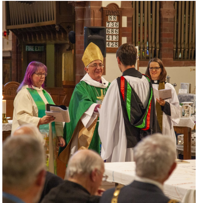
Lichfield: Telford New Minster