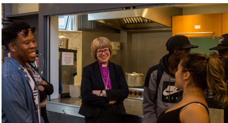
Diocese of London: Capital Youth