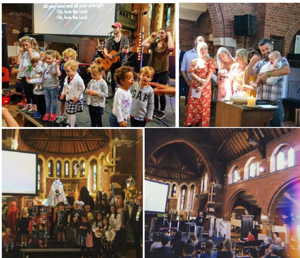
Diocese of Chichester: Growing the Church in Crawley, High Hurstwood, Brighton & Hove, awarded January 2017.

The first projects supported in the 2014-16 funding period are now beginning to reach completion. Staff are working with two dioceses to trial an approach to the final evaluation of these projects to help our understanding of how best to capture the outcomes and learning from them.