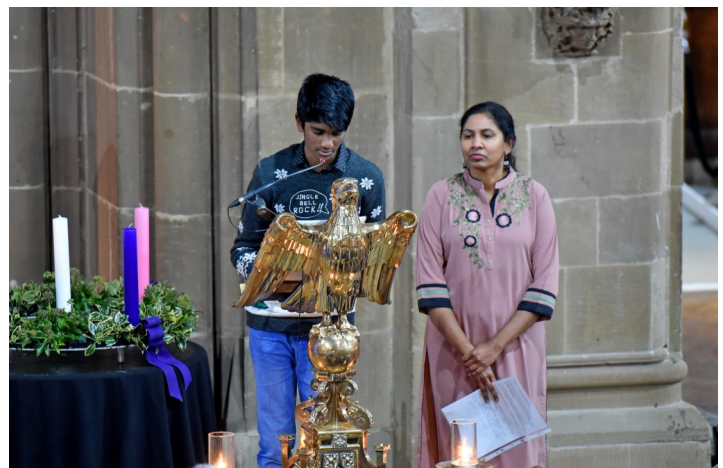
Leicester: Enabling BAME Mission & Ministry