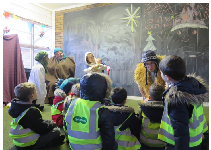
The 'through the keyhole' Christmas story