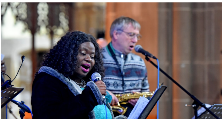
Diocese of Leicester: Enabling BAME Mission & Ministry