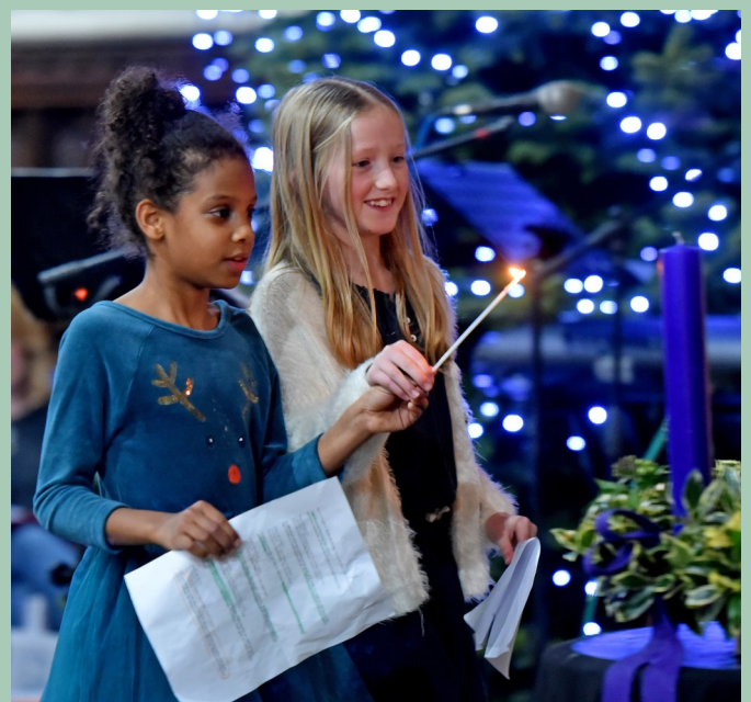
The carol service at Leicester Cathedral

In December the diocese hosted its Global Carol Service in Leicester Cathedral which gathered Christians from different cultures and ethnicities to discuss their Christmas traditions and to discover their universal shared experience of Christians celebrating Christ's birth.