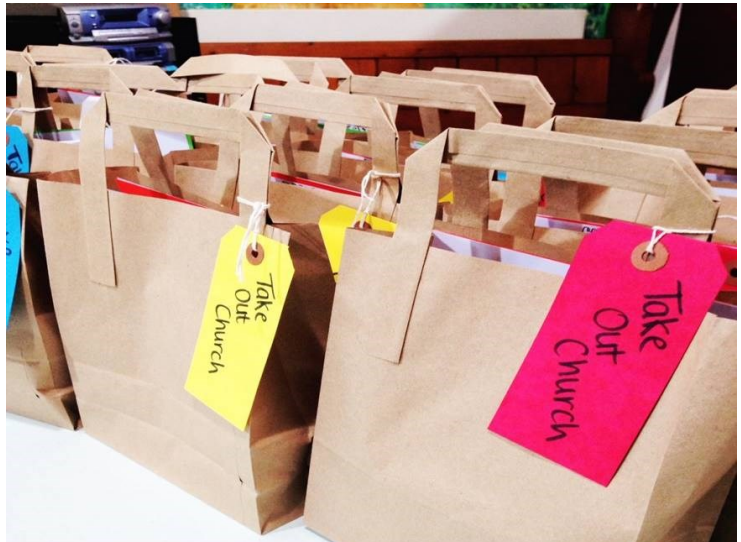
Bags for 'Take out church'