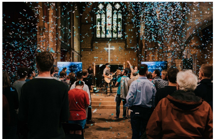
Exeter: Growing Mission in the City of Exeter