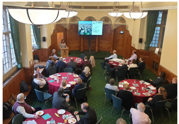
The General Synod fringe meeting on Mission in Deprived Communities

SDU staff regularly communicate insights from the SDF programme to dioceses in supporting the development and delivery of their programmes. We are also encouraging SDF project leaders in dioceses to share learning on particular issues with their counterparts elsewhere, e.g. through workshops. A seminar about SDF projects working in deprived communities took place at the 2020 General Synod. This heard learning from three projects in the dioceses of Canterbury, Blackburn & Sheffield.