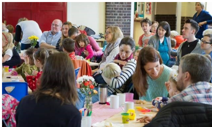
Diocese of Birmingham: People and Places phase 2

These figures reveal the scale of the Church's ambition for significant growth and the progress that has already been made towards achieving this