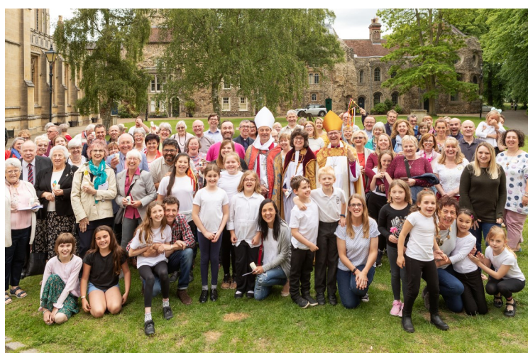
Diocese of St Edmundsbury & Ipswich: Growing in God: Mission and growth in Ipswich deanery and rural Suffolk, grant awarded December 2018

Funding for Rural Areas Since its inception in 2014, £18m of SDF has supported projects which are focused wholly or in part on mission in rural areas. For example, Salisbury diocese's project to renew hope through rural ministry and mission seeks, in partnership with Sarum College, to train and equip ordinands for rural ministry; to give serving clergy experience of rural ministry and to support clergy and lay people in evangelism and mission. St Edmundsbury and Ipswich diocese is investing £2 million in developing the existing Suffolk Fresh Expressions community through forming small missional ecclesial groups enabling fresh expressions of church and three rural church-planting churches. We will continue to evaluate the progress and outcomes of all the projects