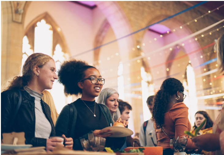
Truro: Transforming Mission Phase 2; investing in focal ministry in St Austell, Camborne, Truro and Liskeard