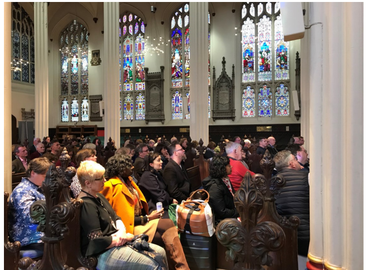
St Martin-in-the-Fields; HeartEdge project, awarded 2019

From 2020 applications for non-diocesan funding has closed, instead organisations will be able to apply for Innovation Funding to develop their ideas.