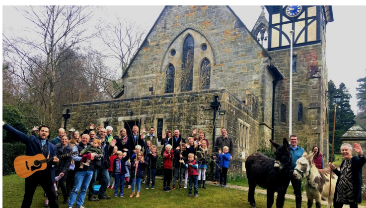
Diocese of Chichester: Growing the Church