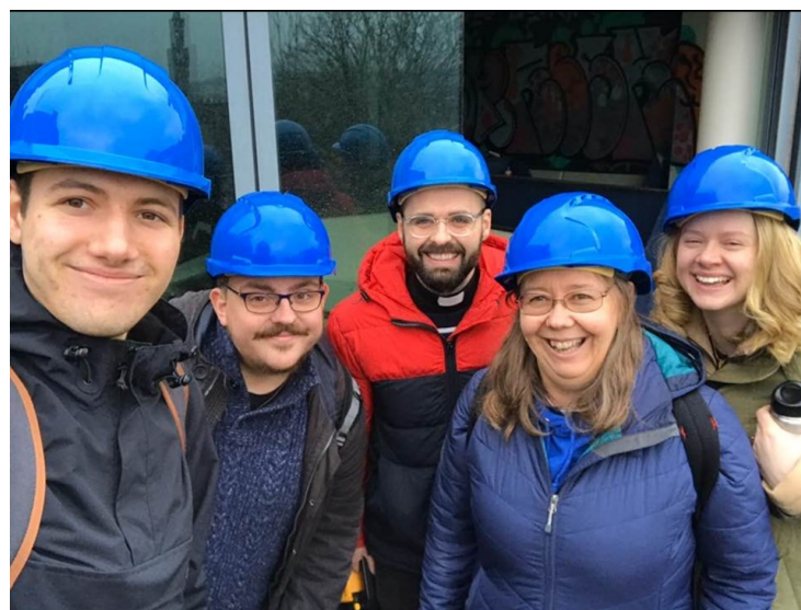
Leeds: Revitalising Mission in Bradford Phase 2