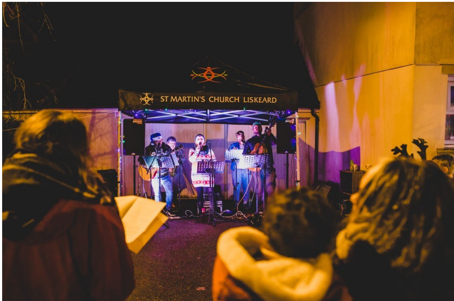
Outdoor worship at St Martin's Liskeard, as part of Truro's Transforming Mission Phase 2; investing in focal ministry in St Austell, Camborne, Truro and Liskeard project, awarded in 2019