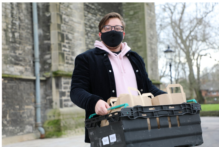
A volunteer in Southampton in Winchester's project Mission Action Phase 2