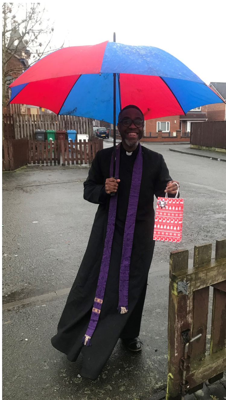
The pioneer priest at The Ascension, Hulme, where HeartEdge at St-Martin-in-the-Fields is working in partnership with the diocese of Manchester in the Revitalising Manchester Dioceses project

In the meantime, the Board is reviewing the application process to ensure it is easy to use and will attract high quality proposals.