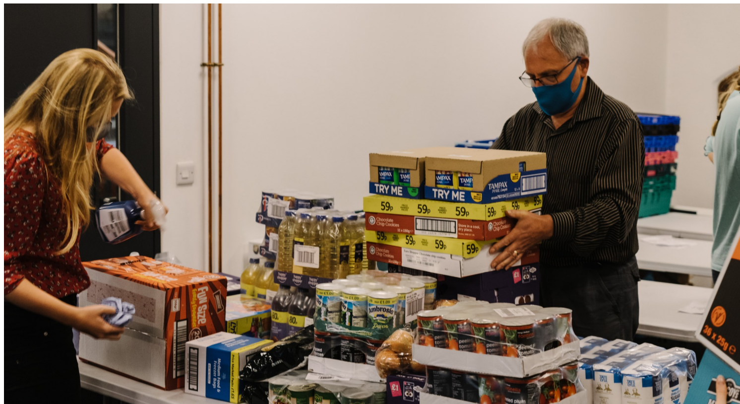
Volunteers at the foodbank supported by St Nic's, part of Bristol's Resourcing Mission & Growth across the city of Bristol and the Wider Diocese project, awarded in 2017