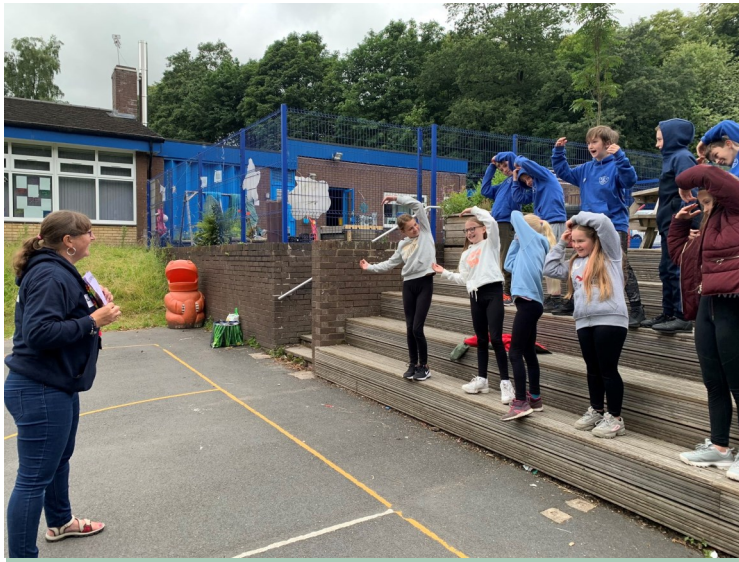
A Year 6 Transition workshop in Manchester's Children Changing Places project