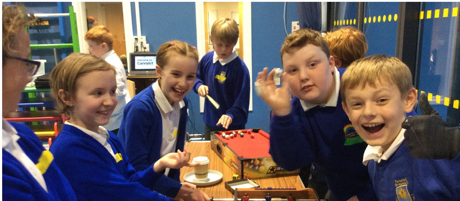
Farnsfield Connect, part of the Diocese of Southwell & Nottingham's 2018 award Church Planting & New Worshipping Communities