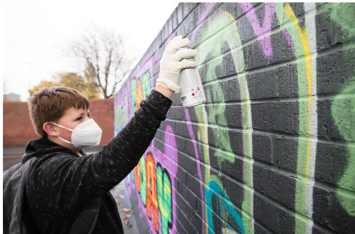
Community graffiti in Oxclose in Durham's Growing Hope project