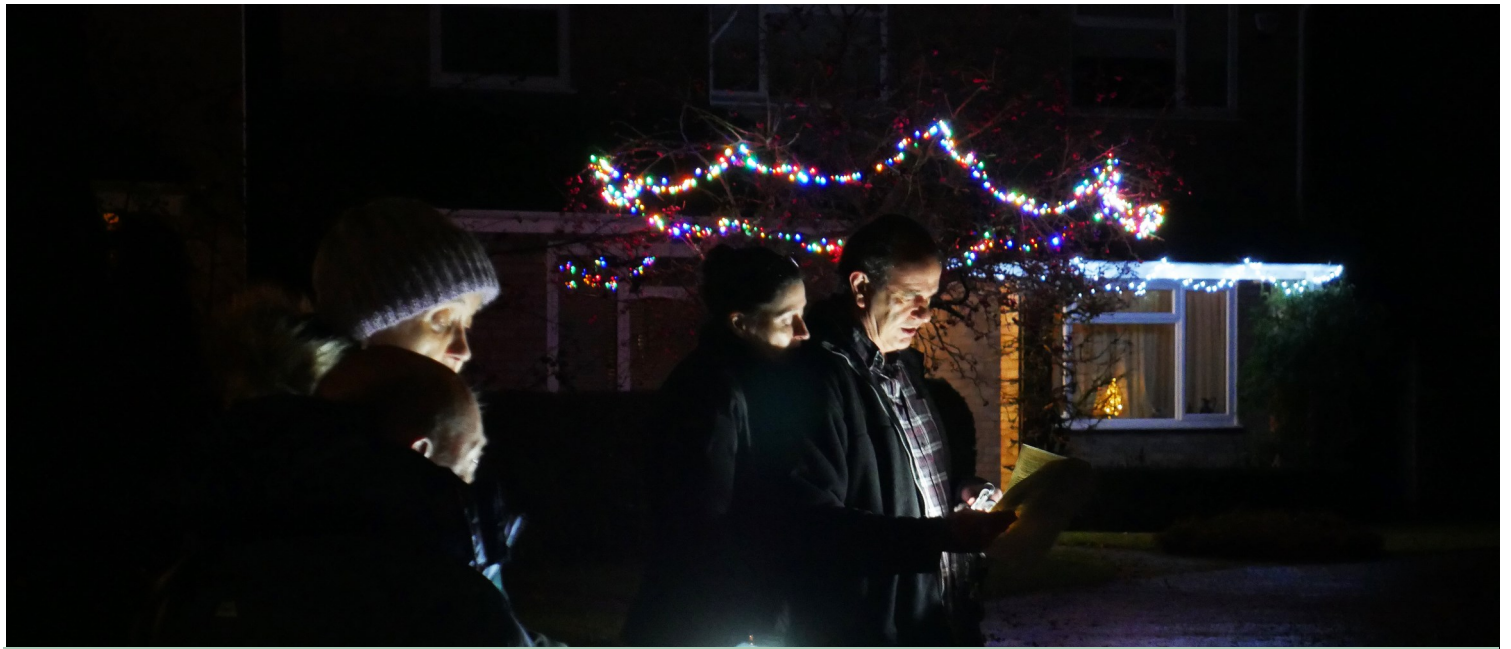
The Diocese of St Edmundsbury & Ipswich's Growing God in The Countryside held doorstep carols in the village