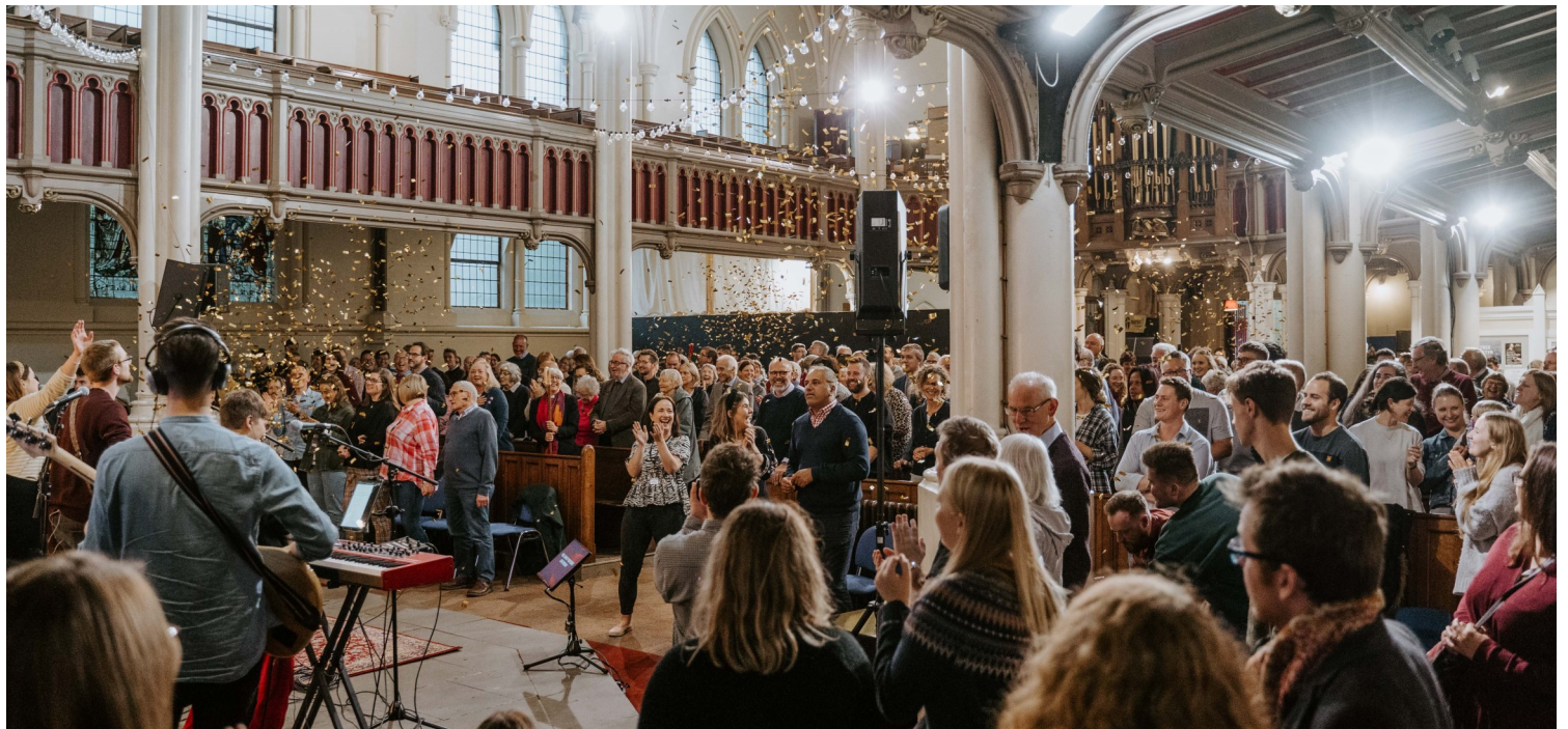
St Thomas' church, part of the Dioceses of Newcastle's 2018 award Revitalising Ministry in the Heart of Newcastle