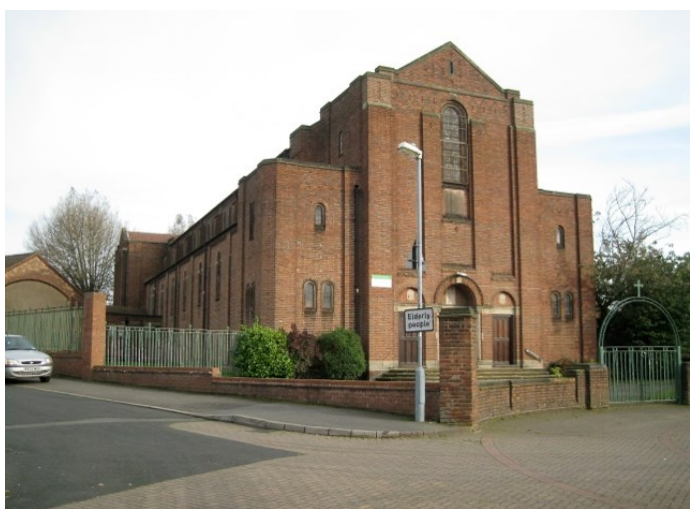
St Mary's Church, Pye Hayes, which is being revitalised as part of Birmingham's People & Places project