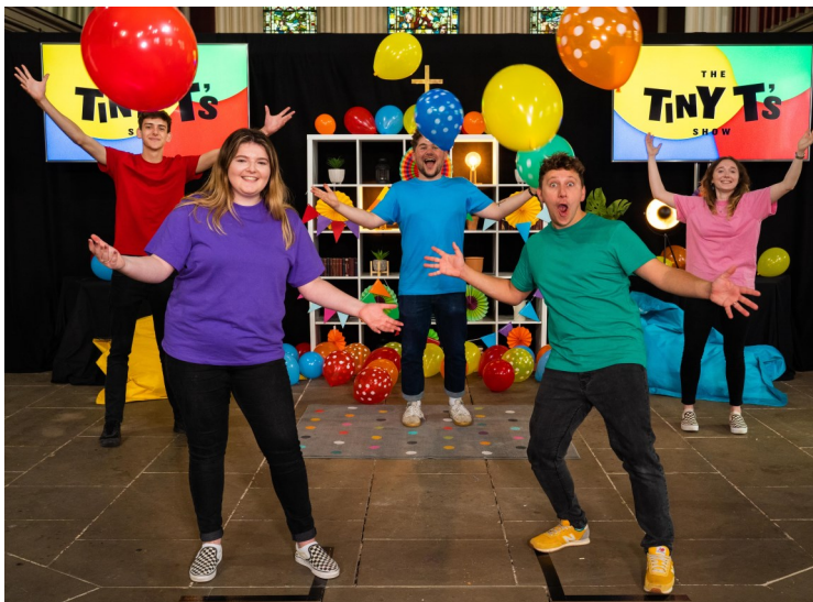
Online family services taking place at St Thomas' church in Newcastle