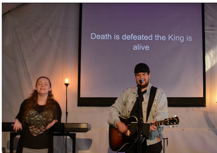
St James in the City, part of Liverpool's Missing Generations project