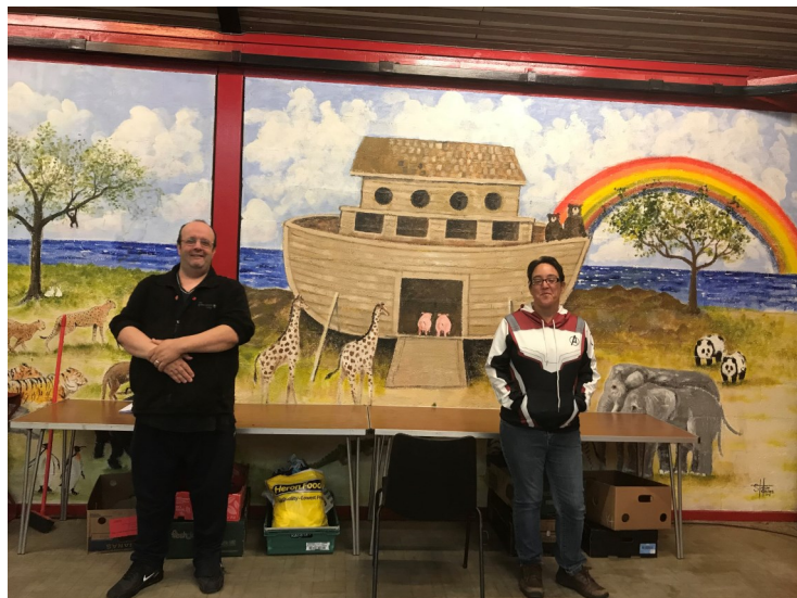
York's Mustard Seed Project in Bransholme