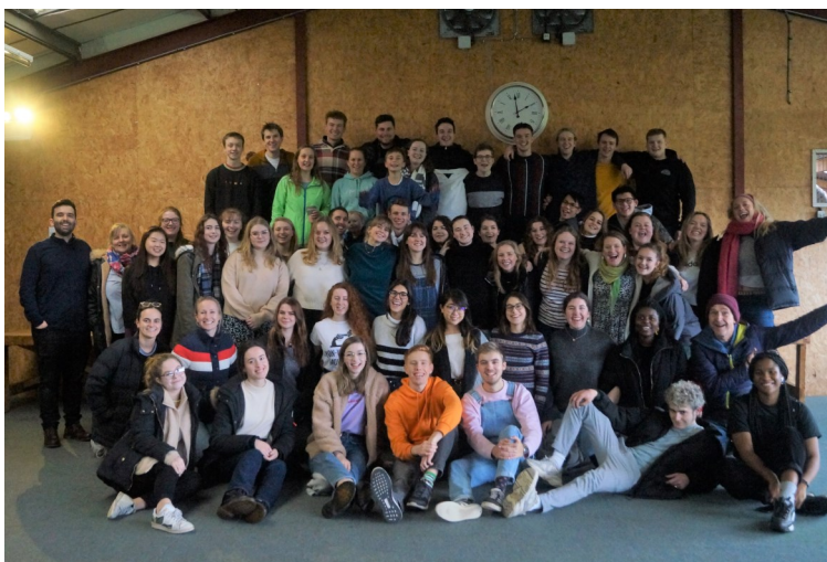
St Nic's Bristol's Students February 2020 Weekend Away

Diocese of York; Mission amongst those in their 20s-40s, awarded in 2018