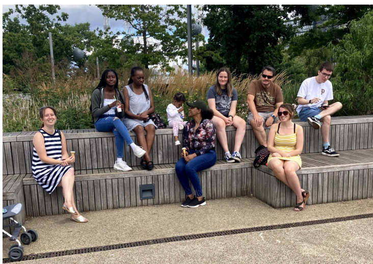
Some members of E20 congregation in the Olympic Park in Chelmsford's Renewing Newham project