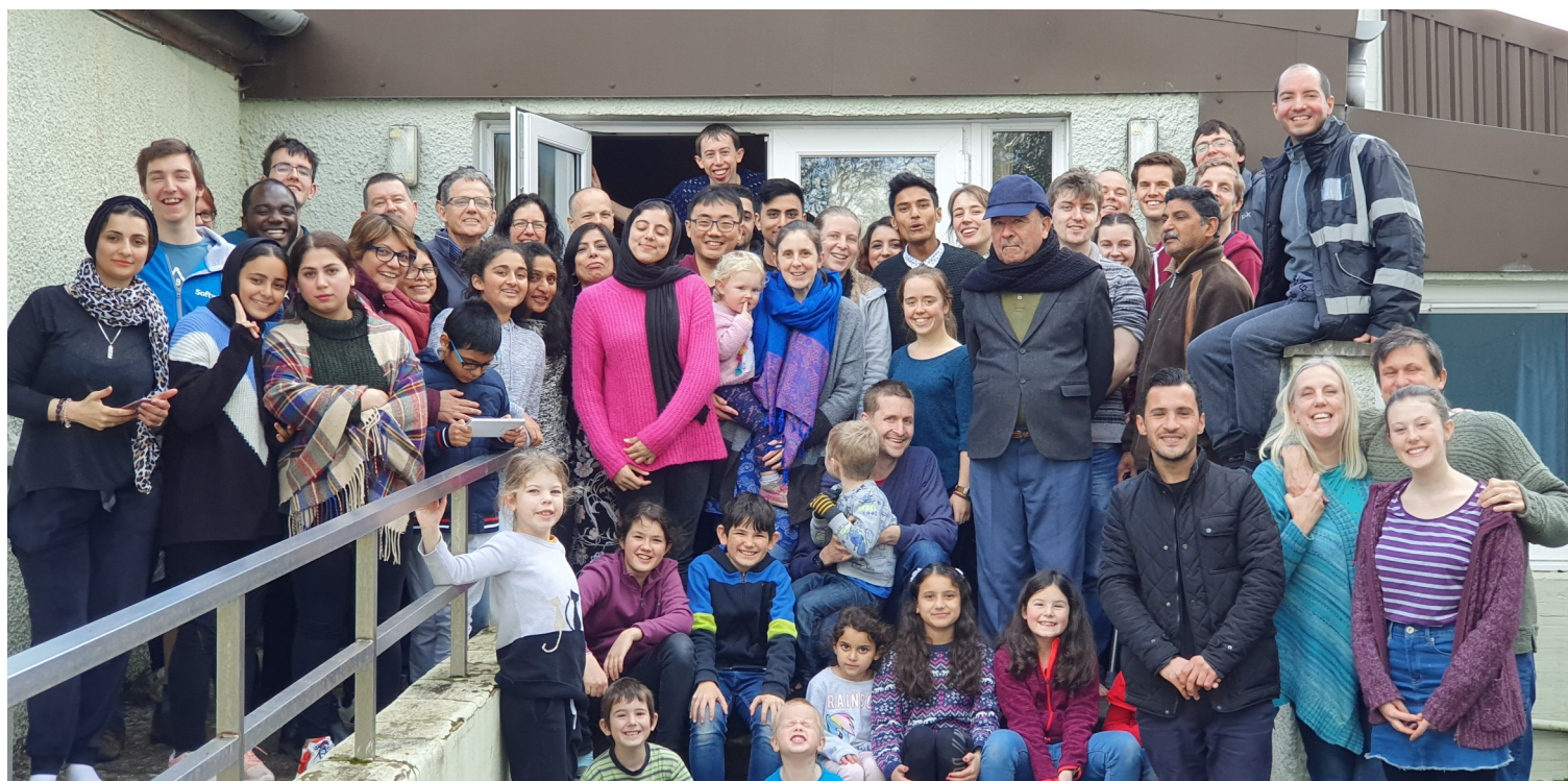
Part of the Antioch Network in the Diocese of Manchester's 2018 Small to Small Church Plants project