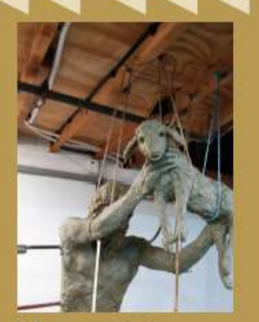
5 The Cotswold lamb