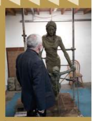
4 Admiring the Virgin and Child

THE STATUES WILL BE FINISHED AND READY TO INSTALL IN AUGUST 2021