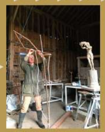
1 The outline frame