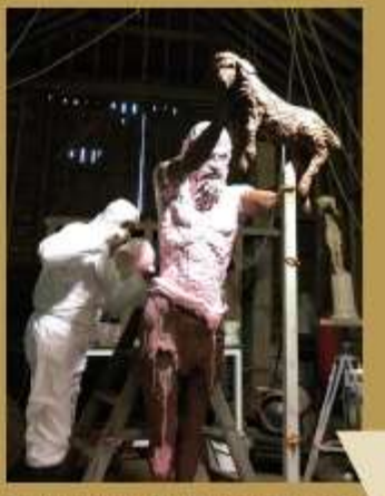
3 Preparing the silicone mould