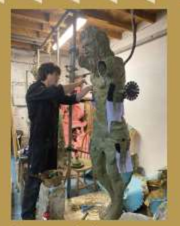
6 Preparing for the ceramic cast