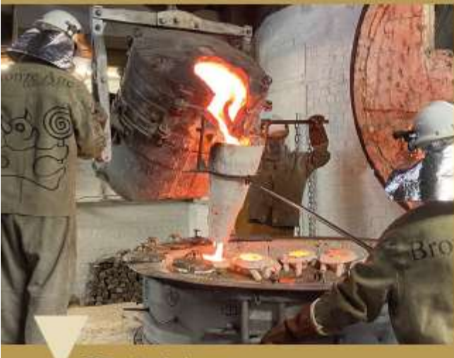
7 Pouring the bronze