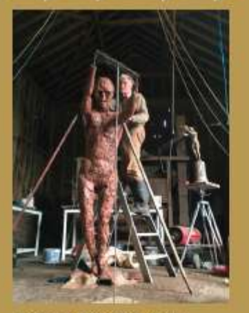
2 Creating the clay model